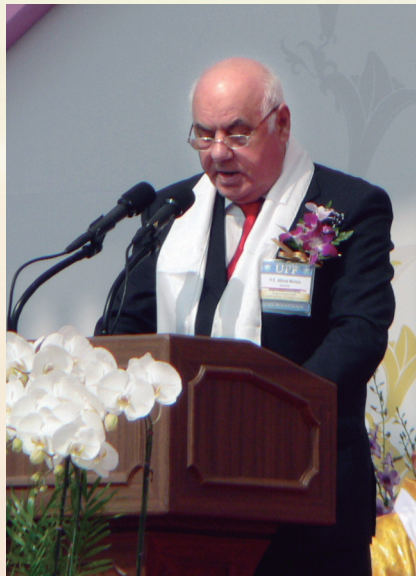
Alfred Moisiu, president of Albania from 2002 to 2007, congratulates all the couples. He brought his deceased wife's picture to Korea so they could participate in the Blessing Ceremony.

It was a very beautiful experience and showed how we all are the same as brothers and sisters and sons and daughters of