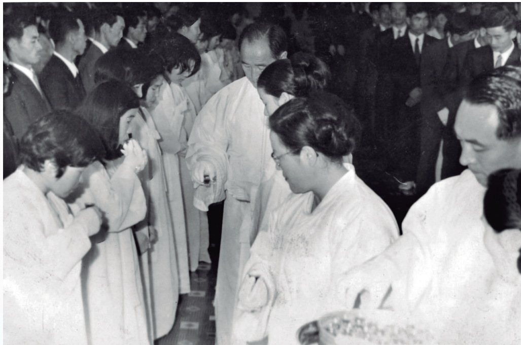
True Parents at the Holy Wine Ceremony for the 777-couple Blessing Ceremony, which took place on October 21, 1970; the brides and grooms came from ten nations.

Amsterdam, and I made some kimchee for True Parents. I really prayed with all my heart, feeling so grateful to be able to do this for the returned Lord, praying to honor True Parents with all my heart. Later I heard that Father really enjoyed the kimchee. I was so thrilled that I thought I should make some more. I was floating on a happy cloud that Father had liked my kimchee, so the next time I made some, I didn't pray as hard. And he didn't like the next lot I made! That taught me that when we are serving True Parents we have to have a heart of absolute reverence, humility and love. Father senses everything and cannot accept something unless it is offered with the right heart.