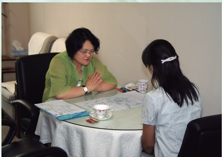
Activities in the 21 Heavenly Fortune Center Left: A presentation slide showing the state of a family in relation to the couple. Because the love of a couple is the barometer of a rise or fall in fortune, which determines the extent to which ancestral sin is filtered out, the couple is of primary importance. That is to say, a good couple filters out the sins of evil ancestors. Right: A personal counseling session can help clarify concepts that many of the guests are encountering for the first time.