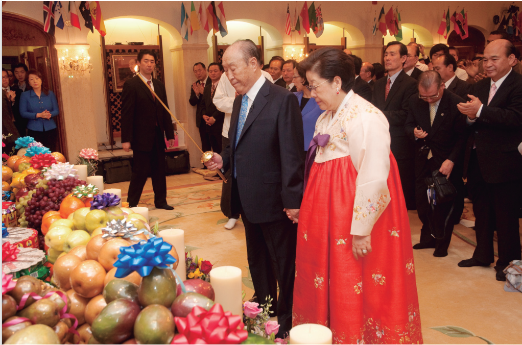
True Parents at the celebration for the Foundation Day for the Unified Nation of Heaven and Earth, on October 3 at East Garden, in the State of New York

I have never told anyone about her last words to me, her final words that she bid me to keep to myself. Actually, there were spiritual phenomena, which she saw with her own eyes. She saw mountains and the sea, and these looked like the mountains and the sea that surrounded us. So she thought the vision was actual, but it wasn't.