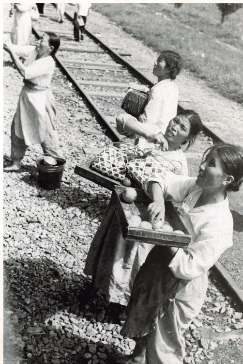
When Father started his mission in the South, life there was grim; 3 million North Korean refugees only made matters worse. Here, mothers sell fruit at a train station in 1954.

In relation to this point, speaking of his environment, Jesus said, "Foxes have holes and birds of the air have nests, but the Son of Man has no place to lay his head." It was my destiny to experience almost the same thing in my life. TW