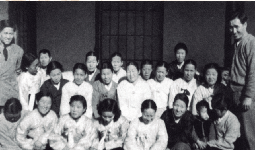
Members in Daegu celebrate Father's February 9, 1954 birthday