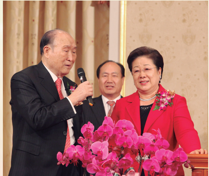
True Parents at Cheon Jeong Peace Palace on October 15, the day after conducting the Blessing Ceremony; Father spoke for six hours at what had begun as a lunch banquet.

and freely talk about their experience, knowing that the people they meet will likely have already heard about the blessing and be curious.