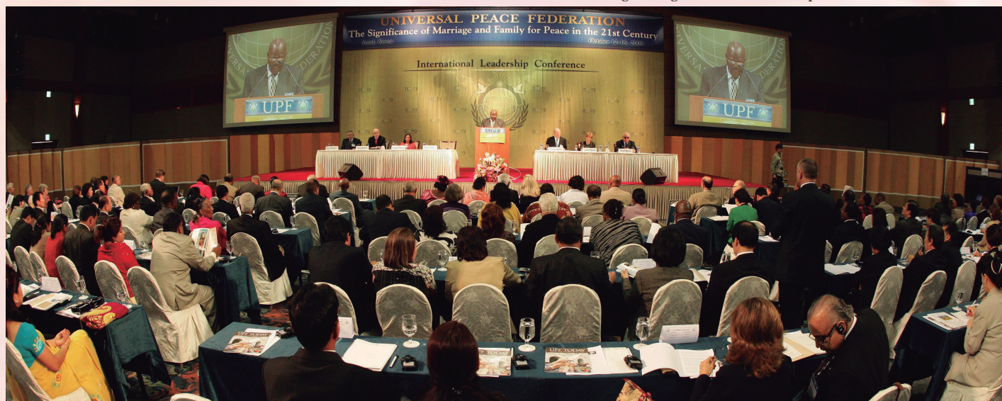
The invitation to the International Leadership Conference on the Significance of Marriage and Family for Peace in the Twenty-First Century included participation in the Blessing Ceremony as couples, or alone with a spouse's photograph.