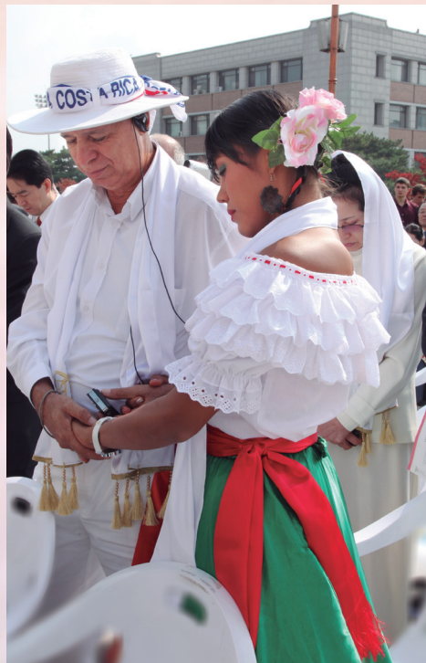
During the benediction prayer, a couple from Costa Rica who attended both a UPF conference and the Blessing Ceremony