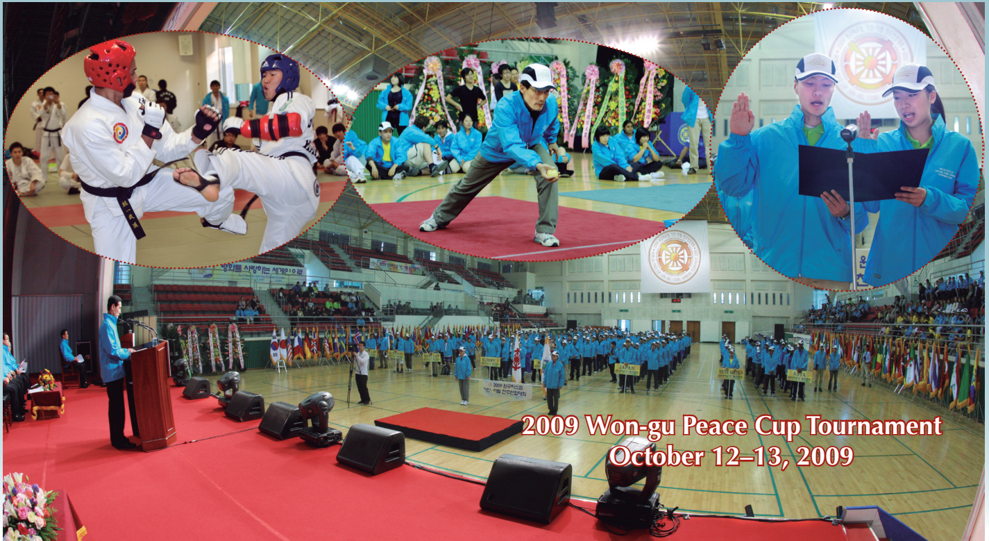
2009 Won-gu Peace Cup Tournament October 12-13, 2009