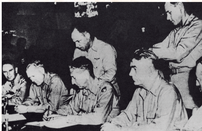
The Armistice Agreement ending the Korean War was signed, on July 27, 1953, by Kim Il-sung (left) and UN commander Mark Clark (right). Meanwhile, regardless of the worldly environment, Father focused his "whole self on realizing God's will."