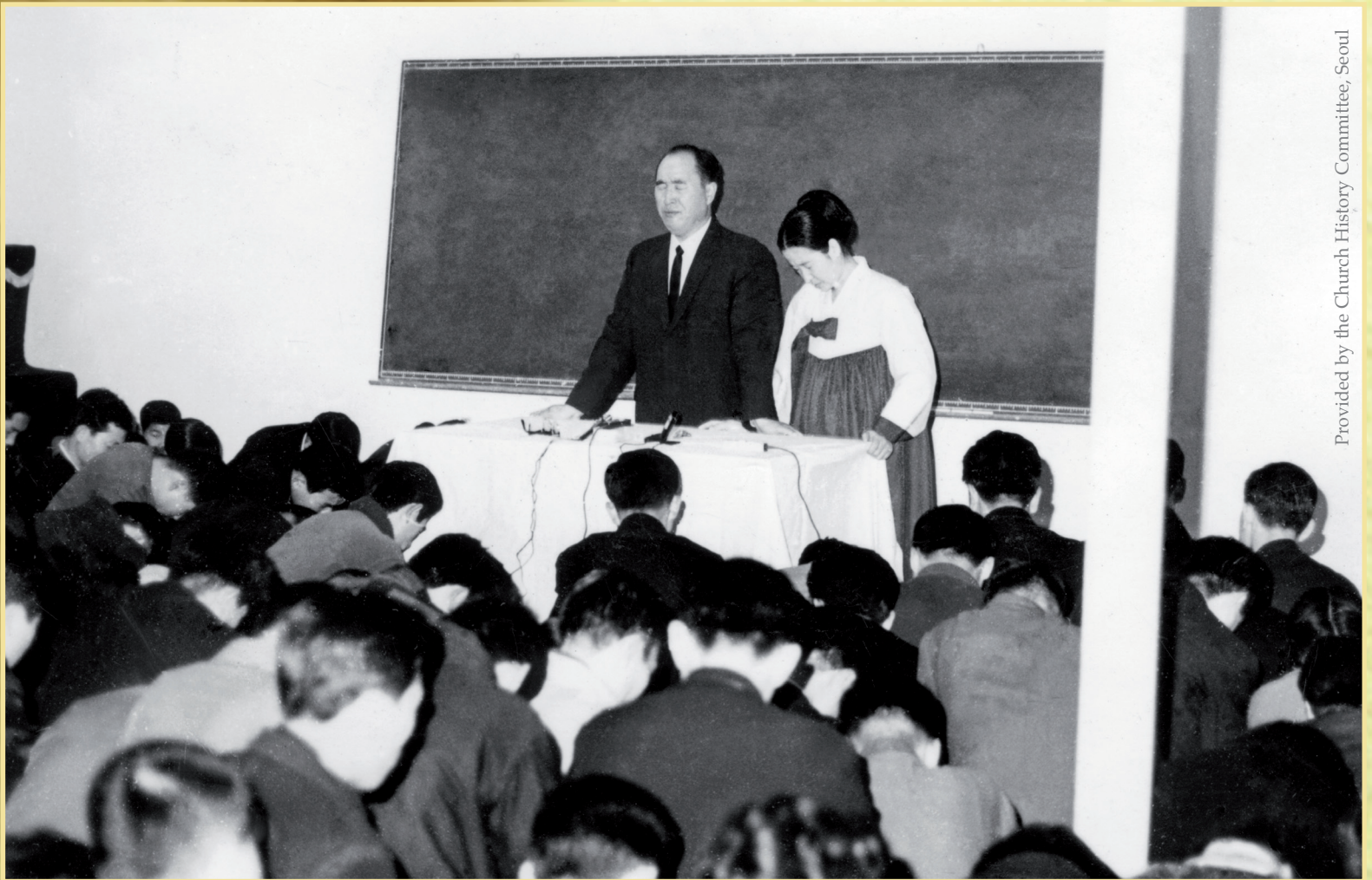
True Parents pray on the first God's Day, in 1968, which came on the foundation of their first seven-year course

traditional churches, because of the disputes and divisions in those churches, and because their doctrines are illogical.”