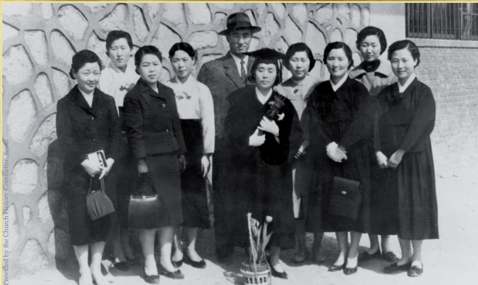
In 1955, Ewha Womans University [sic] expelled professors and students for attending the "Tong-il Church." This woman (center) transferred to another university. Father and her fellow "Ewha members" pose with her on graduation day.

conesses she'd surveyed were going to church only "as a matter of form."