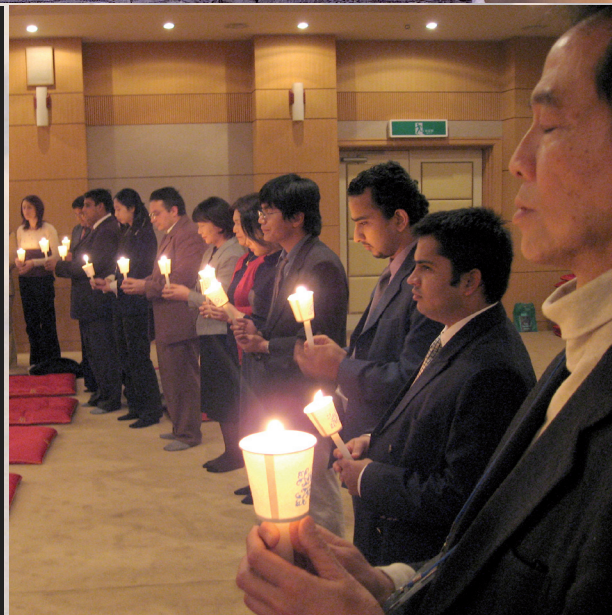
Above: Graduating from the seminar involved a candlelight prayer ceremony and photos with the instructor; Below: As a microcosmic exercise in mind–body unity, during meditation, participants stave off all thoughts and concentrate only on their breathing and cultivating a feeling of gratitude.

You cannot just know something and that’s the end of it. We have to change society; we have to help the diseased and the poor. We are very practical in terms of our theology. We have tried to be engaged socially. We have done big activities, but how focused are we on the central tasks we have to fulfill within the