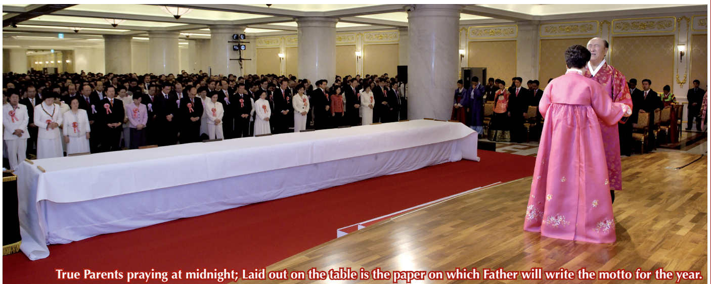
True Parents praying at midnight; Laid out on the table is the paper on which Father will write the motto for the year.

liberation and complete freedom. As the nation at the center and core of the Cheon Il Guk federation of the cosmos, this will lead to the liberation of the homeland that will enable us to declare the complete liberation of all nations and the complete release of the entire universe. Furthermore, we can now designate and proclaim the day of declaration enabling the liberation of the cosmos and surrender of the realm of heart of the world of the 4th Adam to be brought together from this point on and mobilized again.