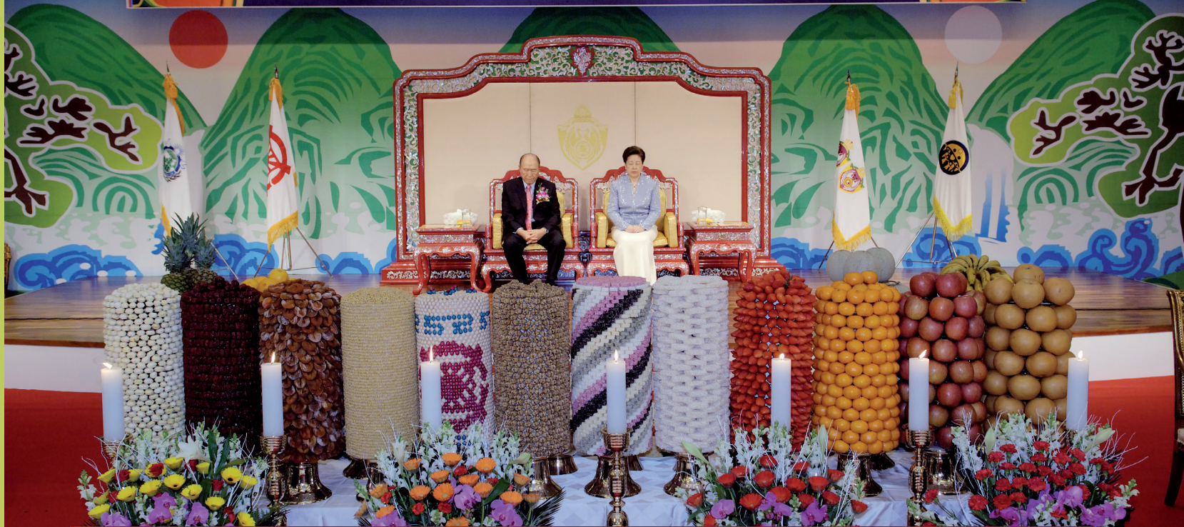
True Parents at Pledge Service on the 6 th anniversary of the Coronation Ceremony for the Kingship of God on January 3, on which day Jesus' birth was also honored. Father had asked the headquarters to prepare one offering table for all the ceremonies from True God's Day to January 3. The preparation of items takes 3 days. On site, one team of 15–20 men and women do the stacking. White chestnuts (symbolizing God; first stack on True Parents' right) are the most difficult to deal with. A second team of people prepare the holy food that True Parents will eat. True Parents touch the food with their chopsticks, allowing God to eat.