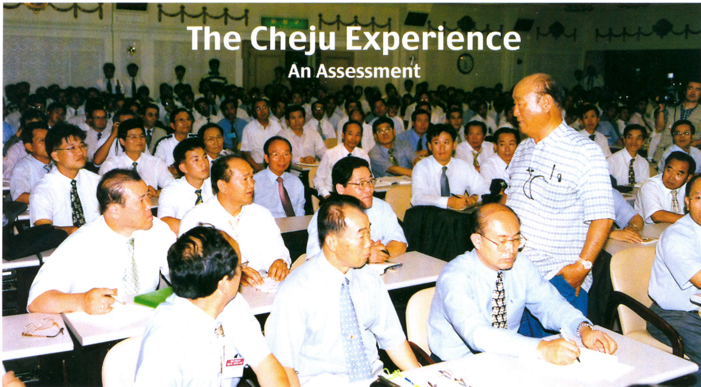
SEUL STUDIO/TONGHIL SEGYE