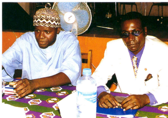
Photo left, a young Muslim cleric (at left) with our church pastor, both of whom spoke at the conference

Now in Senegal since this conference we feel more confidence and we believe that through IIFWP we can bring good results to Heavenly Father and True Parents. This was our national offering to God. ♦