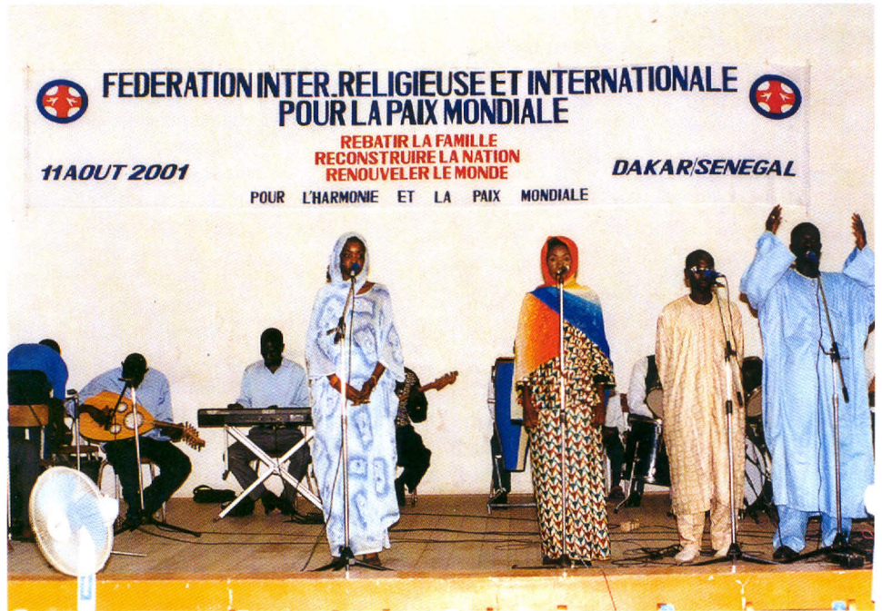
The Muslim choir that sang for the conference and helped bring the spirit of unity

Soon afterwards, when the pastor of the Celestian Christian Church began his address, which was mainly centered on the Bible—the parable of the good Samaritan—he asked the audience to