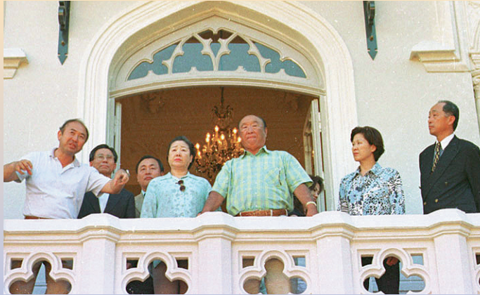
Father and Mother look over a building that is to be dedicated as a new headquarters in Uruguay, South America