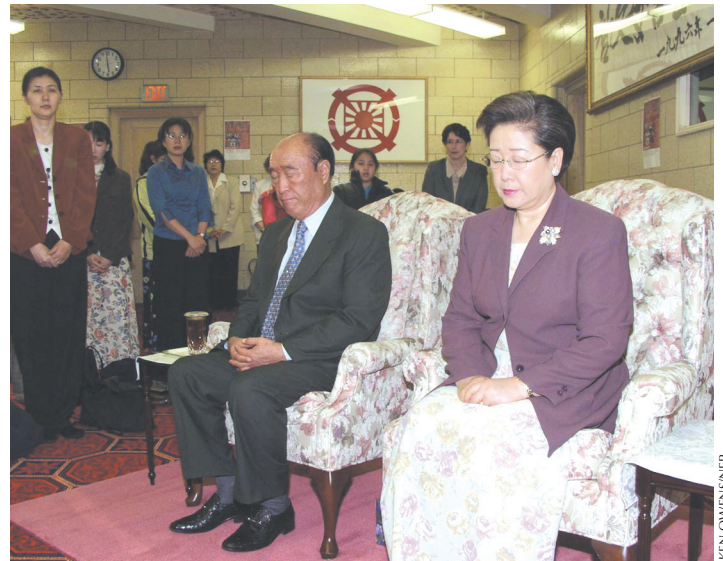
Father and Mother pray before the May 1 anniversary celebration for the founding of HSA-UWC in 1954

Peter is saying this completely intoxicated by the Holy Spirit around nine in the morning. Before, he was not a confident man, but now intoxicated with