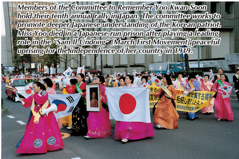
Members of the Committee to Remember Yoo Kwan-Soon hold their tenth annual rally in Japan. The committee works to promote deeper Japanese understanding of the Korean patriot. Miss Yoo died in a Japanese-run prison after playing a leading role in the "Sam Il Undong" [March First Movement] peaceful uprising for the independence of her country in 1919.

I agree that living for others is a legacy that will remain for eternity. The memory of everything we've experi-