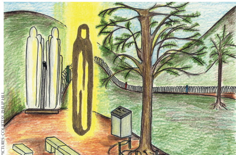
The line of spirits moving toward the Tree of Blessing

One morning I was walking up to the Tree of Blessing I made a stop to recover my breath and to admire the beautiful scenery. Suddenly I could see long lines of spirits moving along the path towards the Tree of Blessing. At different intervals along the path angels were standing at intervals to mark the way and keep the lines of spirits orderly. These were liberated spirits. Three golden angels are permanently there at the Tree of Blessing. They form a triangle and in the middle of this triangle is a huge golden beam going straight up into heaven. These angels radiate pure energy through their bodies, creating an intensely peaceful atmosphere there.