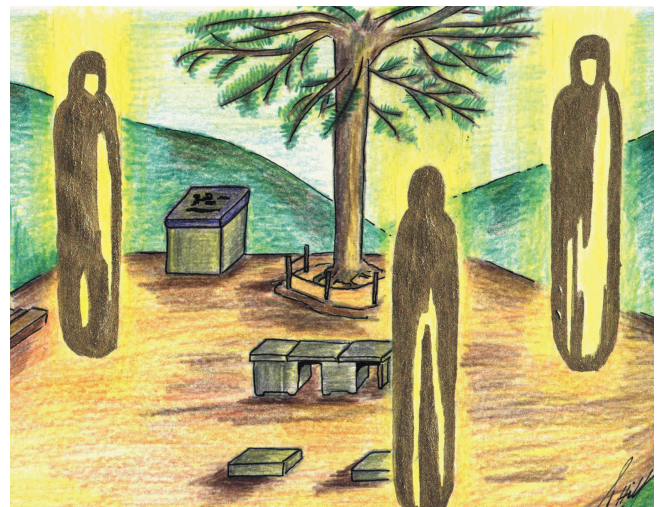
Three golden angels at the Tree of Blessing