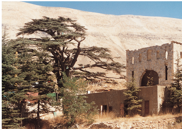
Ancient Roman architecture against a backdrop of a local community; A majestic cedar tree, symbol of Lebanon, stands beside a historic church