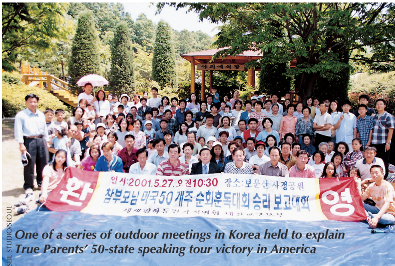
One of a series of outdoor meetings in Korea held to explain True Parents' 50-state speaking tour victory in America

to look at the quality of our relationships. Do we have actual heart-to-heart give and take with brothers and sisters in the church? Do we meet just because we happen to be in the same religious community? Do we really have family-like ties to one another? True Parents have taught us that the only lasting and valuable relationship is the heart-to-heart relationship.