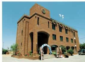
A new graduate school for studies in True Parents, opened May 12th in Korea

Lazarus' younger sister was Mary Magdalene, a former prostitute. In such a humble house, he spent the night. There were only twelve disciples with him at that time. Once, so many people had followed Jesus, but in those final days, he was left with only a very small circle of people. In the