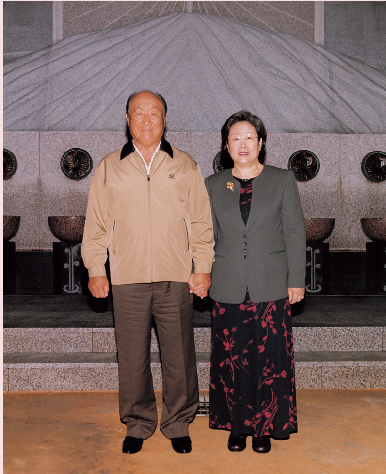
Father and Mother at the "Cheon Shin Su" spring at Cheong Pyeong

Only when you are determined to invest, invest and invest again, can you uncon- sciously create a space big enough for the whole world to come into you and fill you up, based on the seeds you have sown.