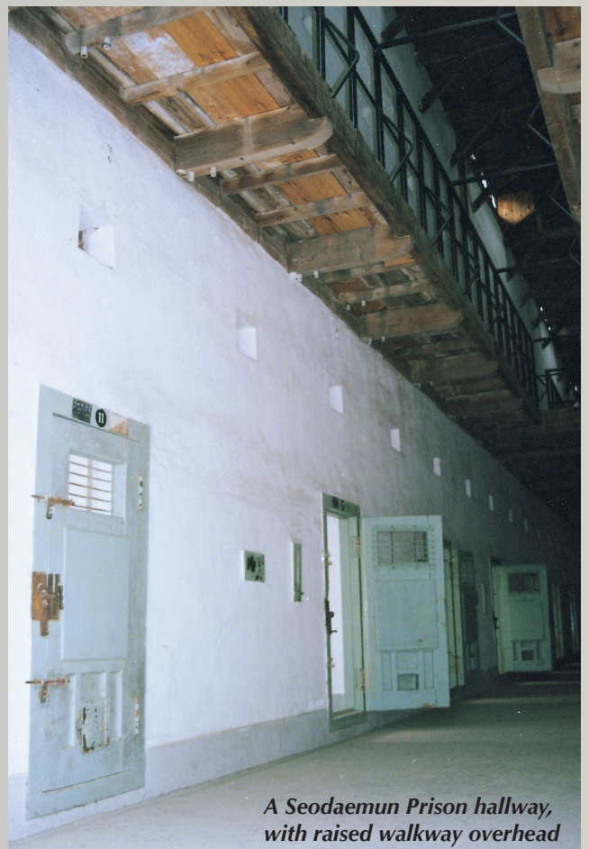
A Seodaemun Prison hallway, with raised walkway overhead