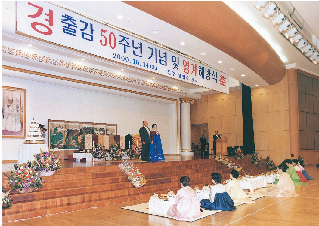
Father and Mother conduct the Ceremony for the Liberation of the Spirit World

our enemies. Korean people are real enemies who have opposed me for the last forty years. So we must love them. You must love the Korean people more than your own children and spouses. You must love them so that they go over the [mountain] pass following in True Parents' footsteps. The wives, and also their children, must cross through the pass. Their husbands are to support their wives and children with all they have. It is their responsibility to make the utmost sacrifice for four years.