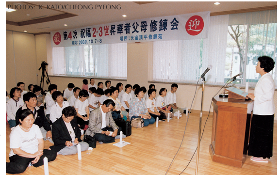
A recent ceremony for ascended blessed children