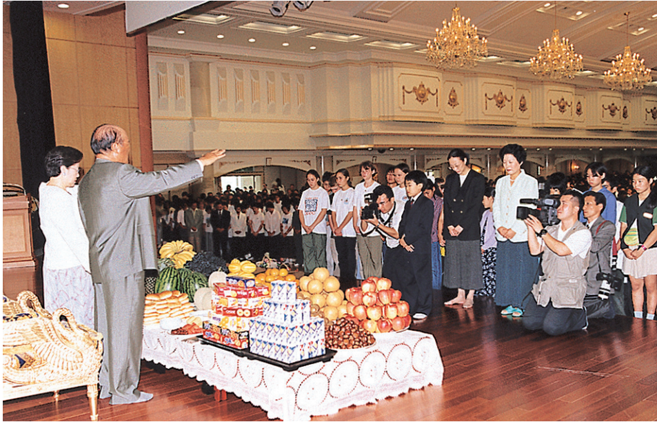
Father and Mother pray at the “Transition of the Three Ages Realm of Oneness Unification Blessing Ceremony”

should learn this by heart and create a unified realm between the physical and spiritual worlds. When a father goes to the spirit world, he becomes an elder brother to his son and the son becomes a younger brother to his father. Therefore, a father and his son can equally call God “Heavenly Father.” What it means is that both fathers and sons are sons before God. Do you understand? [Yes.]