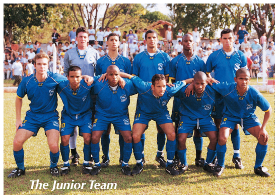
The Junior Team

True Father's vision is to create an international-level team, elevating the game of football by combining techniques from Brazil, Europe and Asia. There have already been some exchanges of players between CENE and the Korean Il Hwa Cheonma team. ♦