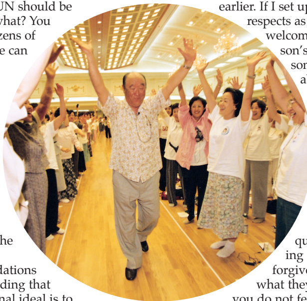
Photo: Father concludes his speech to workshop participants

I hope all of you will have profound experiences and be healthy for the entire 21 days. Good-bye!◆