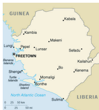
Sierra Leone and neighbors

Why do they fight each other so intensely and brutally? Because of the diamonds. You can see fallen human