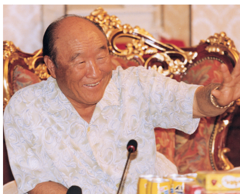
True Parents' arrival at Hannam-dong residence, September 21