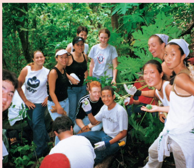
Hanging out and eating fruit in the jungle