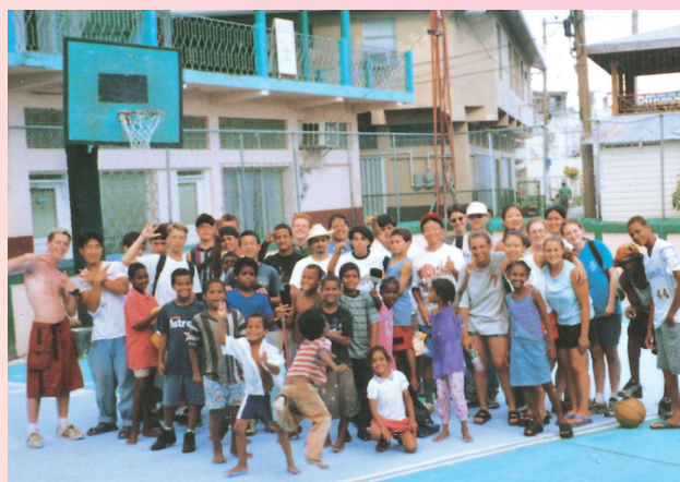
Honduran children join the painting crew that restored the beauty of this local basketball court