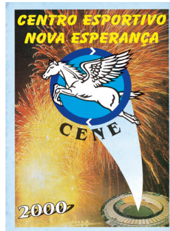
CENE's logo is the same as Il Hwa's

Football is the most prominent sport in Brazil. Prior to the creation of CENE, the nearest team of comparable level was about 250 kilometers away. Launching a team for this popular competitive sport in Jardim has thus brought new life to this town, as well as to surrounding communities. Crowds of several thousand regularly attended home games this past sea-