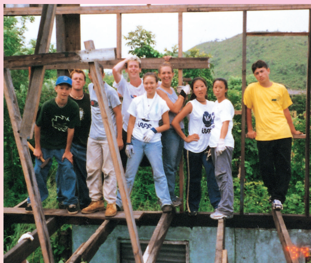
A divine demolition squad poses in the ruins of a house it is about to tear down

With all the camps, workshops, and PLA I have attended, you can probably see that True Parents are a huge part of my life. I don't remember to pray every night and at times I can be very selfish, but my goals in life are to help True Parents accomplish their goal of building the Kingdom of Heaven on Earth. Since I am still young, there are things that limit me from helping out. Sometimes I feel restricted, but that doesn't let me make excuses for