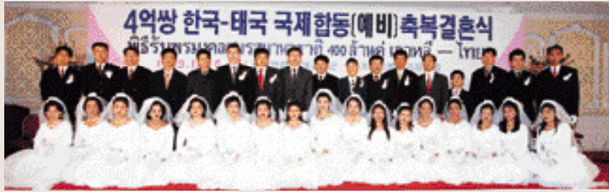
Photo: Korean-Thai couples take a group photo after a preliminary ceremony in Seoul, Dec. 5

Many Koreans are preparing for international blessing with spouses from other Asian countries