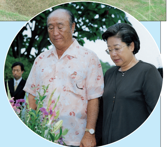
True Parents visit and pray at the Wonjeon during their mid-September sojourn in Korea