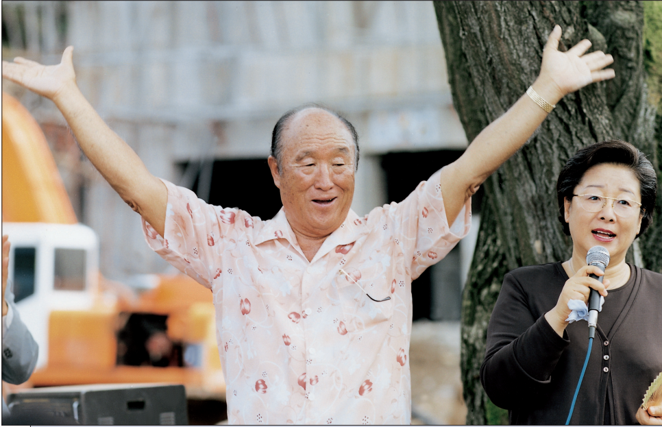
True Parents sing on a visit to inspect the nearly complete Cheonsung Wanglim Palace at Chung Pyung, in mid-September