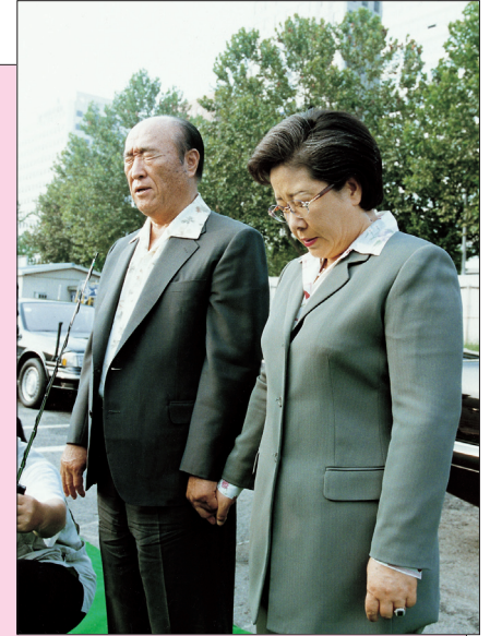
True Parents pray at the Yoido Holy Ground on their arrival in Korea