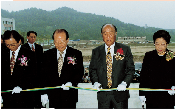
True Parents open a new student facility at Sun Moon University on September 12. Father wrote "Choong Joong Shim" which can be expressed "Place the center of your heart in loyalty."