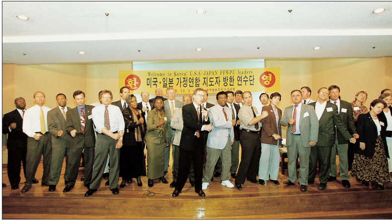
The leaders from the United States sing at the ceremony to welcome them and their Japanese counterparts to Korea, October 2, at the Down Building in Seoul

heart with our Korean Church brothers and sisters. Who could believe such a common feeling transmigrates over the oceans and cultures between us? Only due to Father's training, by the hand of our True Parents' love, have we become one. This trip by American and Japanese brothers and sisters who went to Korea confirmed what we know deep down in our hearts already: we are one in heart. It takes not 40 days to realize this. Members in America can realize this immediately based on the foundation of heart now existing.