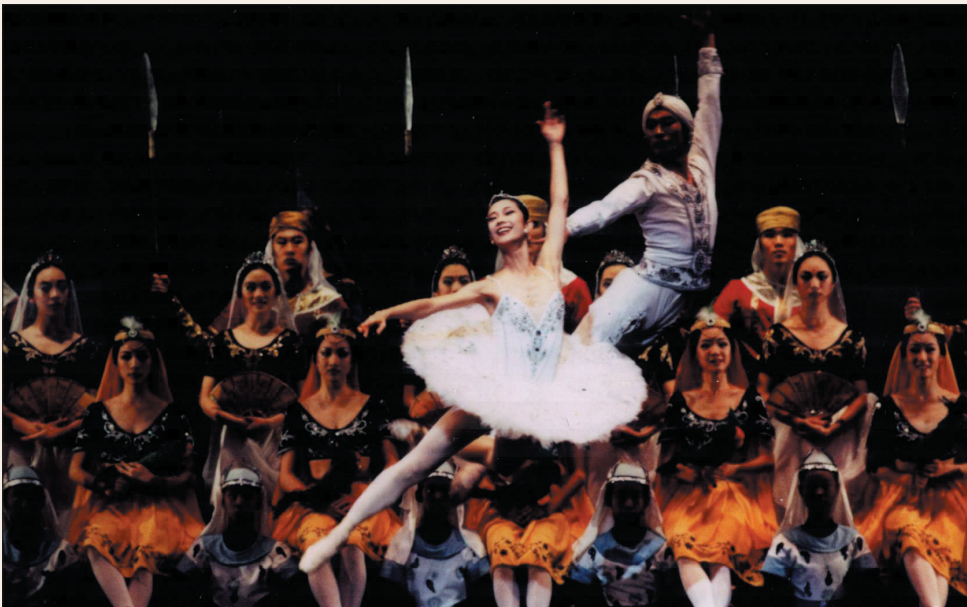
Universal Ballet in preparation for the company's November premiere of La Bayadère at the Sejong Cultural Center in Seoul

October 20, 1999 [Presidential Seal Affixed]