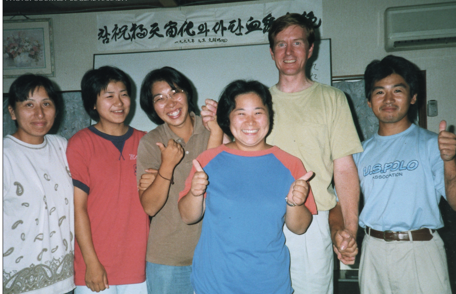
With Japanese "micro bus" fundraising team members

I actively sought to embrace their heart and could weep in prayer each day, feeling united with my Japanese family. After three days there, I had a dream that I was held by my mother, Japan, and taken to Korea and embraced by True Father with such a love as I had not known before, a warm, familial comfort. It became crystal clear to me the principle that we cannot but go through the Mother to get to Father.