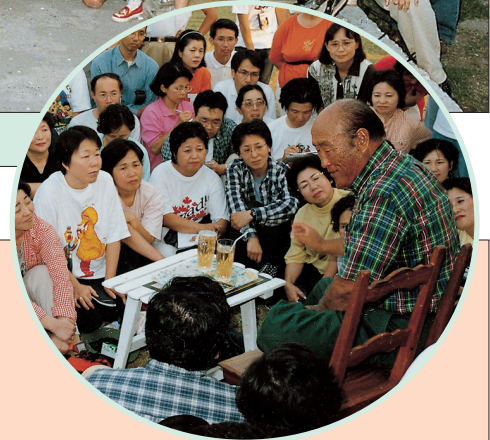
Left: Father speaks at the Ideal Family Education Headquarters at New Hope East Garden Below: Father, Mother and leaders admire a large baku