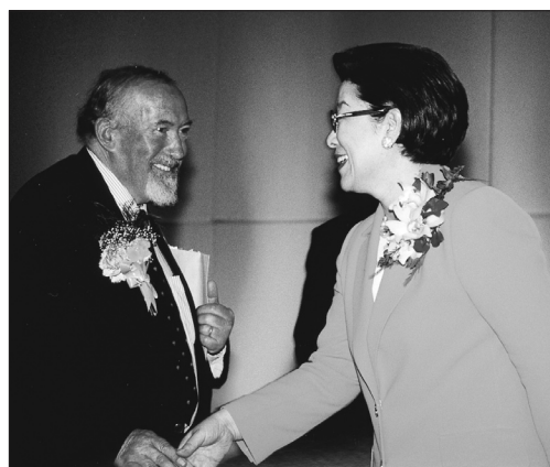
Theologian Dr. Ninian Smart greets Mother onstage in London

It was like the sun had risen on a cool fresh morning when Mother walked out to the podium. Her pure dignified