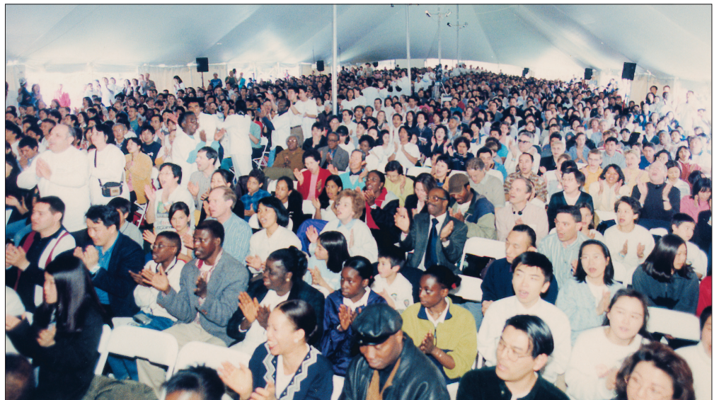
Thousands of members overflowed from the giant marquee on the Belvedere grounds

world of goodness and what is the world of evil. It tells us how we can realize the Kingdom of Heaven but we did not make it our own, for me and my family. Maybe we thought it was just a tool to be used for witnessing. We should have recognized this is meant for me and for my family to grow. We could have built the Kingdom of Heaven. We could have gone to the Kingdom of Heaven. If we had taken this seriously, we would have been reading every single day, and checking if we were qualified to be citizens of the Kingdom of Heaven. No matter what we did, we would have lived