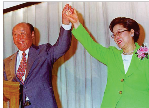
True Parents meet onstage in Montevideo

It was an unforgettable night for everyone. One guest, a former vice-minister of health, told us that he had never seen so many high-class people and lower-class people enjoying