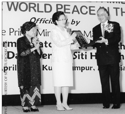
Mother presents a plaque of appreciation to the prime minister's representative

The Prime Minister was to speak personally as the officiator of the conference. Due to illness he was forced to send the Minister of Education on his behalf, who spoke eloquently on the importance of family and of all people living together in harmony. As a nation with Islam as the national religion, but a population which includes a substantial number of Chinese and Indian residents, Malaysia seems to be ahead of much of the world in having faced differences and learned to respect and honor the freedom of others to hold