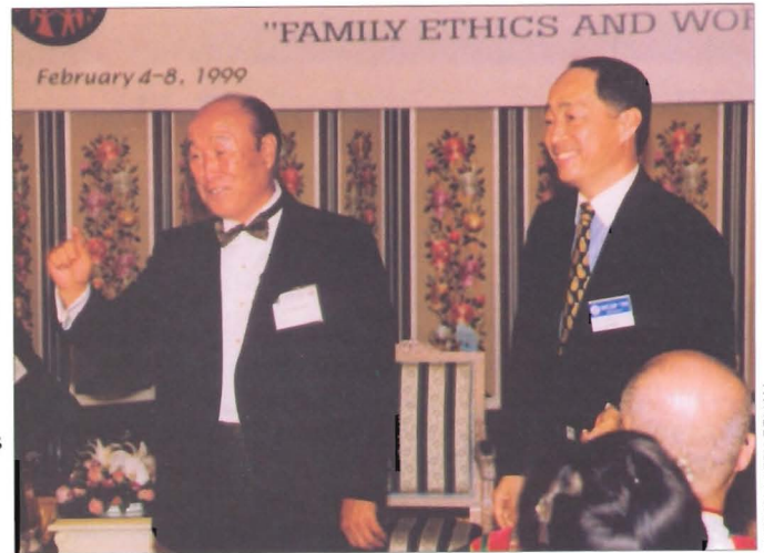
At a special reception immediately preceding the WCSF opening banquet, Father shares his heart