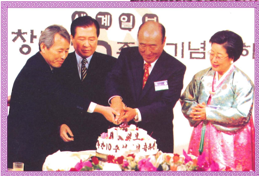
Celebrating with the president of Korea; Seoul, Feb. 1, 1999