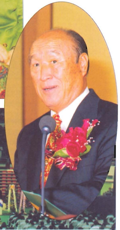
Below: Father's speech in Inchon at Puchon indoor gymnasium; the theme of the tour is written in large white syllables on the banner