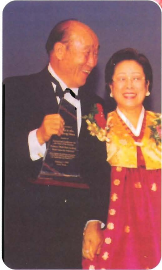
(Above, r., and far r.) Farewell banquet, Feb. 7, Little Angels Arts Center