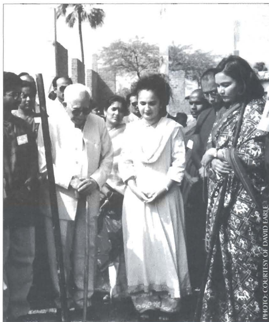
A Muslim prayer is offered prior to the ground-breaking ceremony, which was attended by a member of parliament