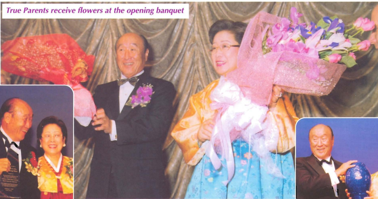
True Parents receive flowers at the opening banquet