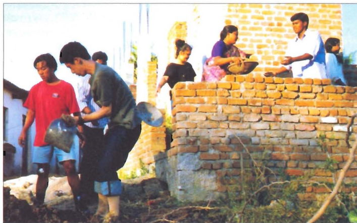
The RYS participants at work on the construction project

The three environmental projects we completed in 1996 were quite successful and two of them, a nature trail and a tree nursery, were subsequently adopted by primary schools to give inner-city children the opportunity to have some contact with nature. Forty-five international RYS participants completed these three tasks, representing almost all