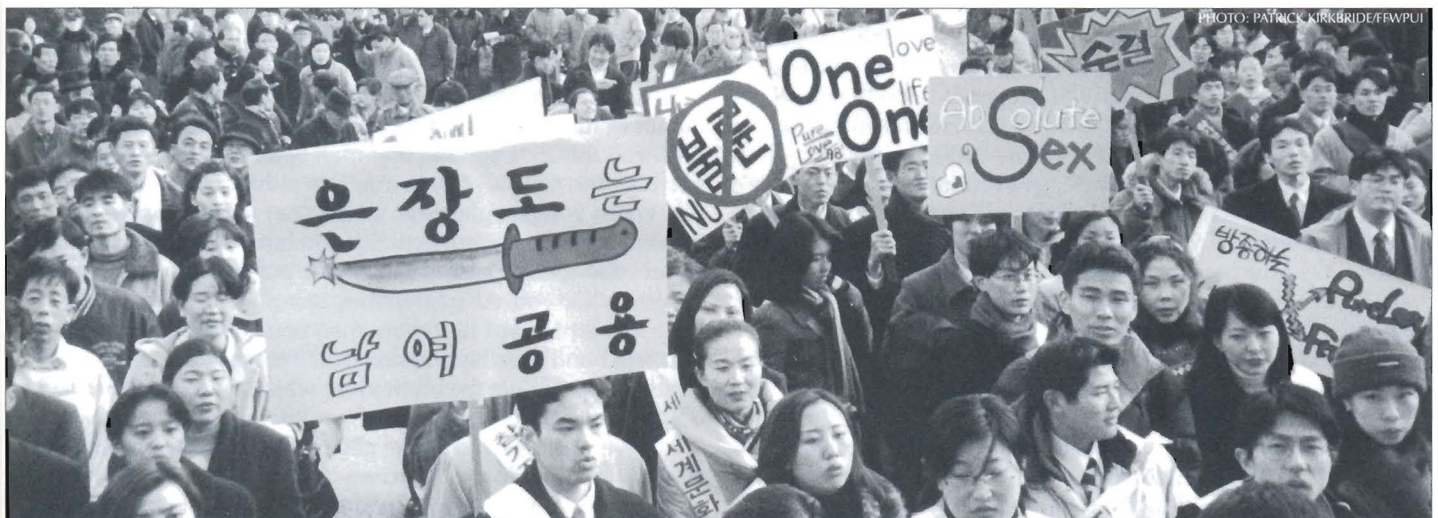
Blessing participants and members attend a rally for pure love in Pagoda Park, central Seoul, February 5