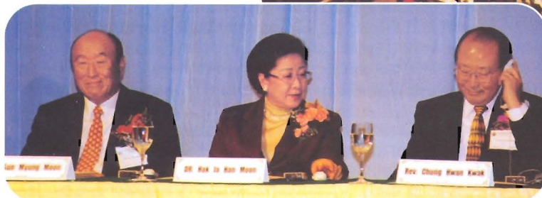
(l. and r.) IIFWP Inaugural Assembly, Feb. 6