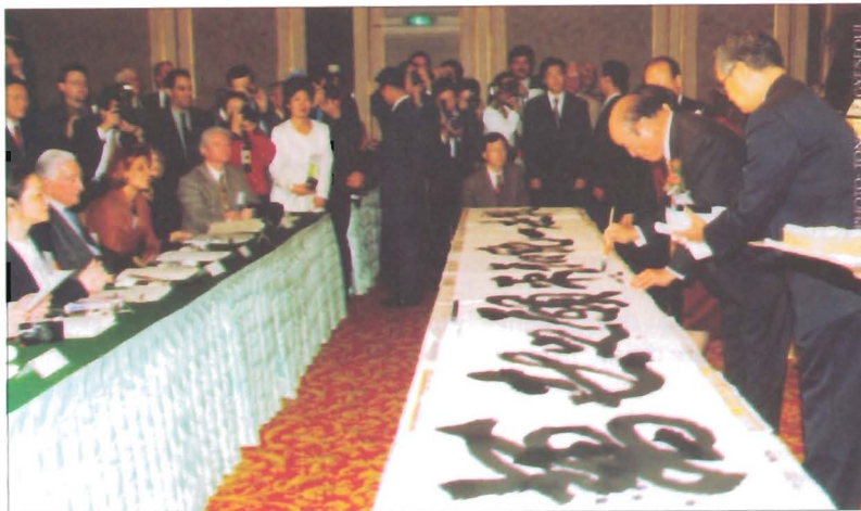
Convocation participants were fascinated by Father's traditional calligraphy skills, which he demonstrated in writing the IIFWP motto