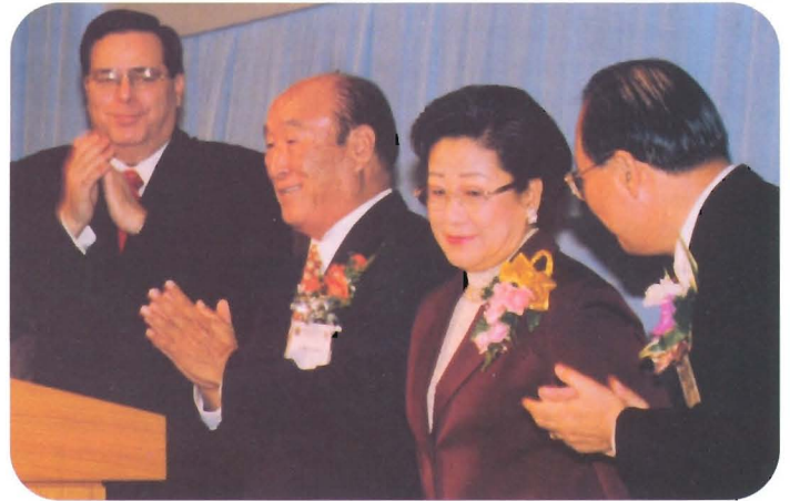
Above: IIFWP Inaugural Assembly, Feb. 6