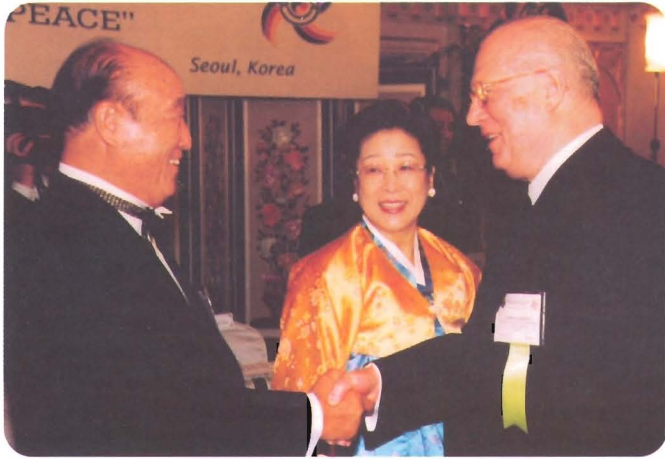
Above: VIP reception prior to opening banquet, Feb. 4