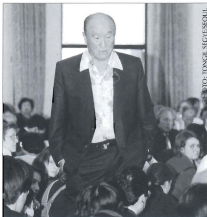
Bringing his message to the members

a big rally. A grandson will tell his grandfather that he saw something great on February 7. Can anyone find fault with this? Such a time has come. Tell the president he can entrust family problems to you. You have a patent on the solution. So we can bring life and save people from sexual immorality everywhere. The age has come to organize seven generations through the 180 families. Those who do so are called Sa-du . Organize a tribal meeting. Give gifts.