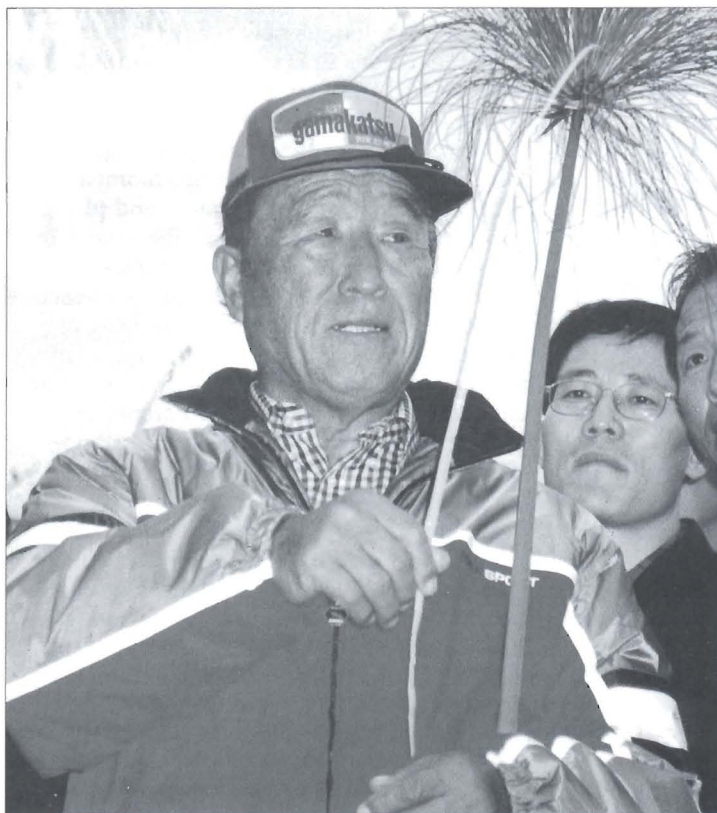
Father's Prayer: "Heavenly Father, please let there be Heaven's unlimited blessing in every corner of the earth..."