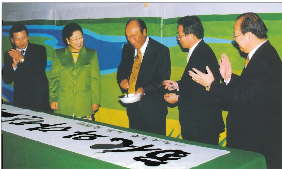
Mother and leaders applaud as Father finishes writing the motto