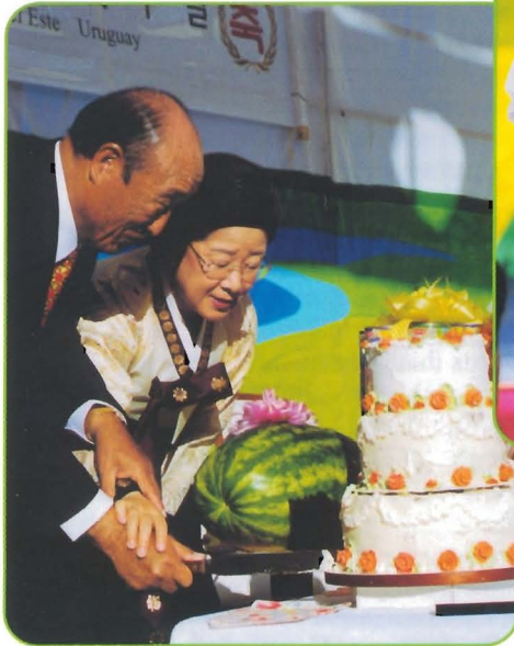
Father and Mother cut the celebration cake