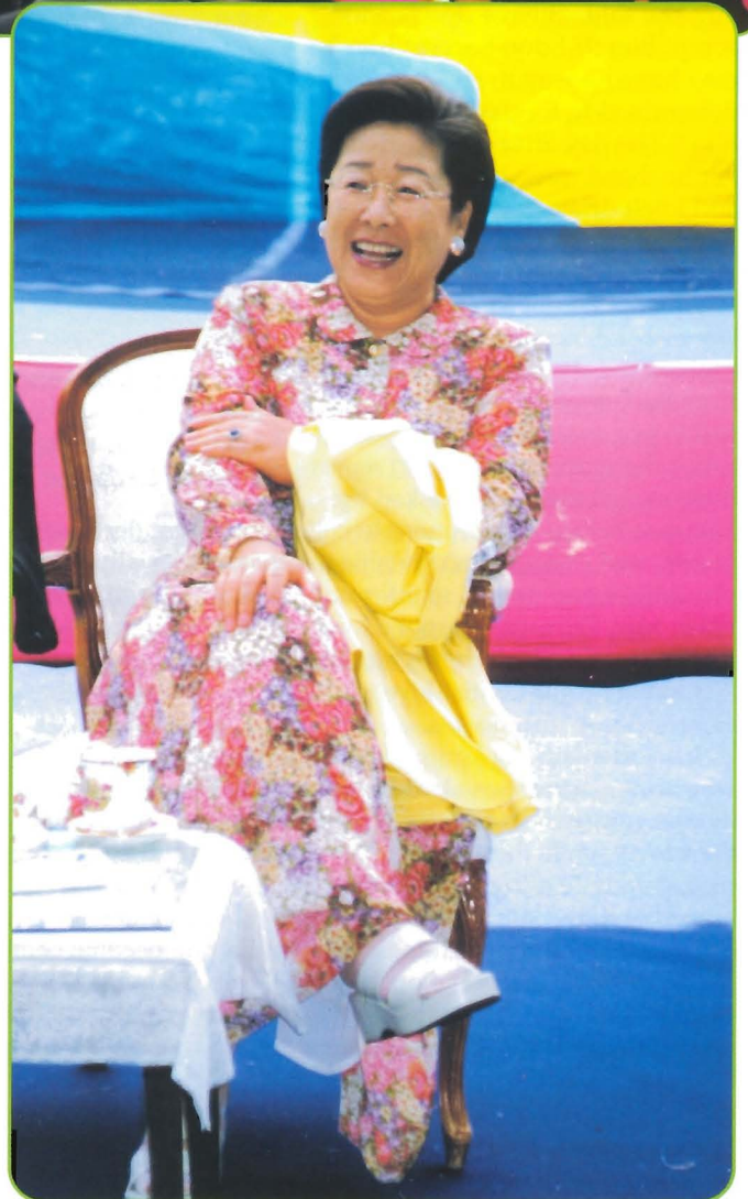
Mother enjoys a lighter moment during Father's speech