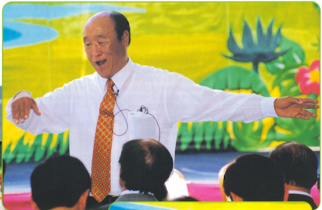
Father pours out his New Year message in the summer sun