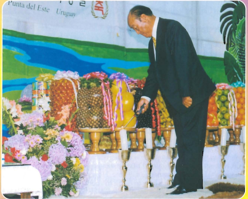
Father lights the commemorative candles