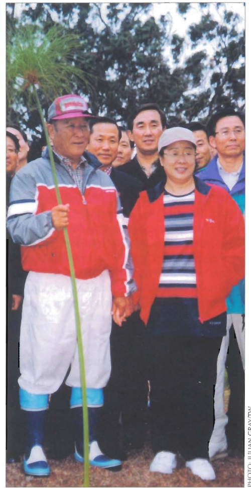
Having toured the gardens to oversee preparations for the True God's Day celebrations, Father meets up with Mother outside the main house; December 29, 1998

For me the true test of what seemed too good to be true would occur in the annual games, the contests for prizes and the King's nod; the sports and fishing competition. I concur with the inspiration that athletic competition does not