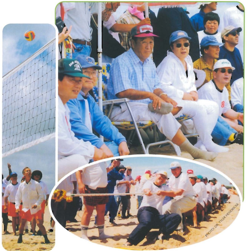
(l.) Father and Mother relaxing at the True God's Day evening entertainment. (r.) True Parents are the most ardent sports fans on this day (January 2)