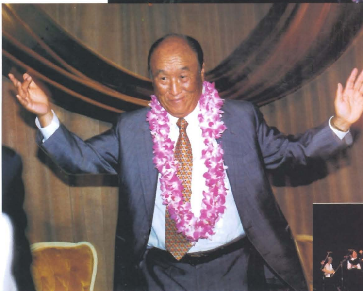
Father bids farewell to the audience attending the evening performance held at the Manhattan Center's Hammerstein Ballroom.