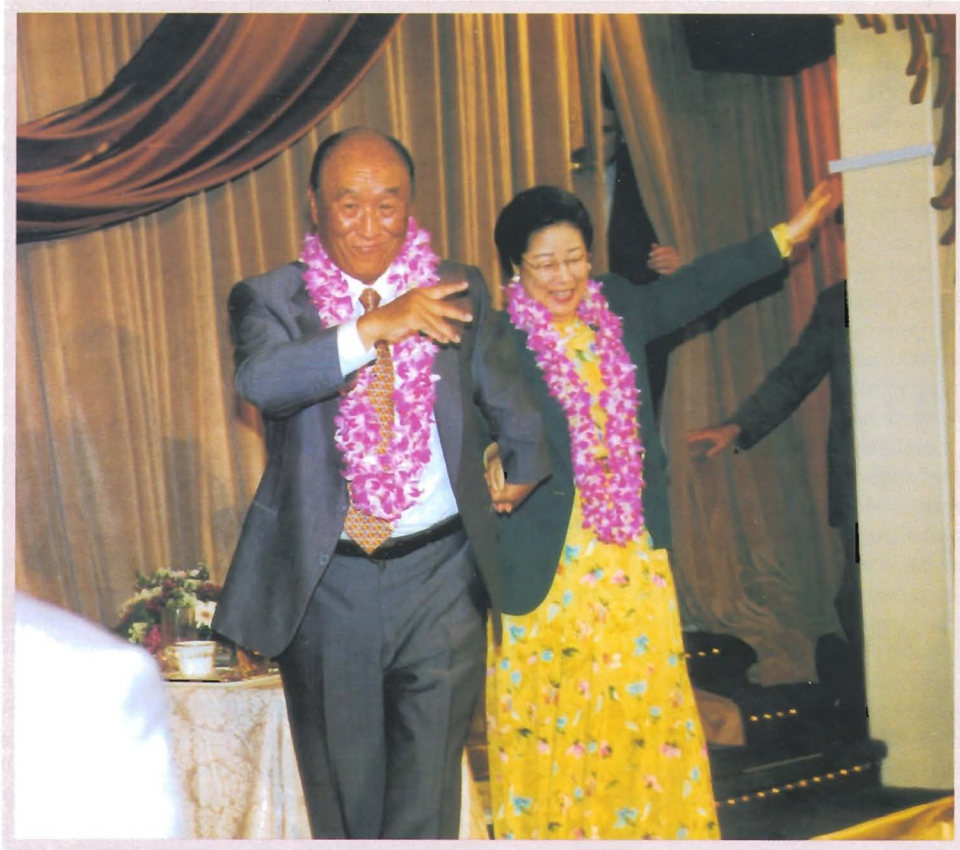
TRUE PARENTS BID FAREWELL TO THE AUDIENCE AT THE MANHATTAN CENTER AT THE CONCLUSION OF THE CELEBRATION OF TRUE DAY OF ALL THINGS. MAY 26, 1998.

“Who is this God? He is our Father. He is our subject of love. He is to be the Father of our family, our tribe, our nation and our world. The one who could be the Father of heaven and earth is the God who is the subject of all. Because human beings were created as the objects of God’s love, when the first human ancestors fell, God lost His partners of love.”