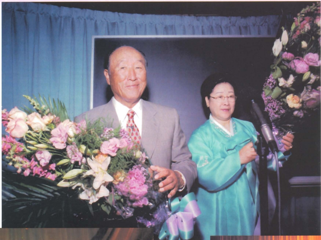
True Parents receive flowers prior to the morning speech at Belvedere