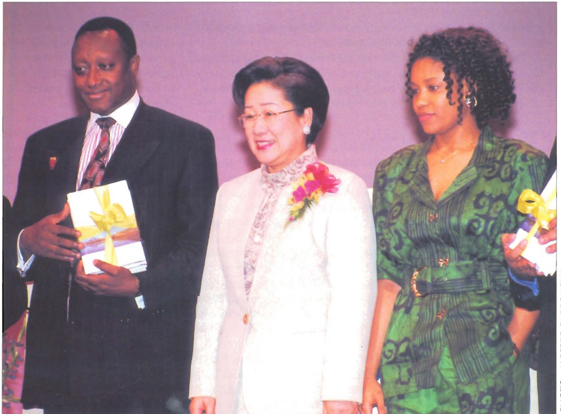
Mother with VIP guests following her speech at the Manhattan Center on April 9, 1998.

The key is to rid ourselves of the ignorance and burdens of the fall. The fundamental question is how to free ourselves from evil love, an evil life and an evil lineage. Only in this context does liberation have any meaning. Only complete liberation from evil brings true freedom. True freedom is self-sustaining.