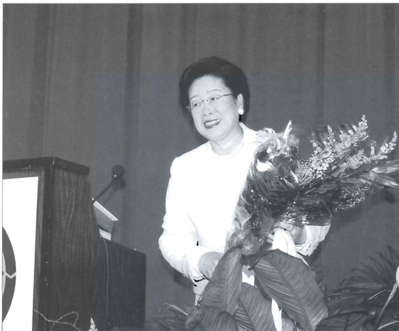
Mother receives congratulatory flowers after her speech at Bridgeport University on April 2, 1998.

May God truly bless you. Thank you very much. ■■■