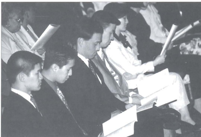
Members of True Family and guests read the written text as Mother reads "Blessed Marriage and Eternal Life" at the Manhattan Center on April 9.