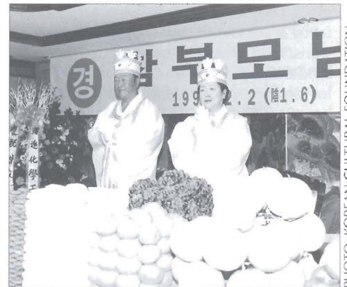
True Parents' Birthday pledge service in Korea.