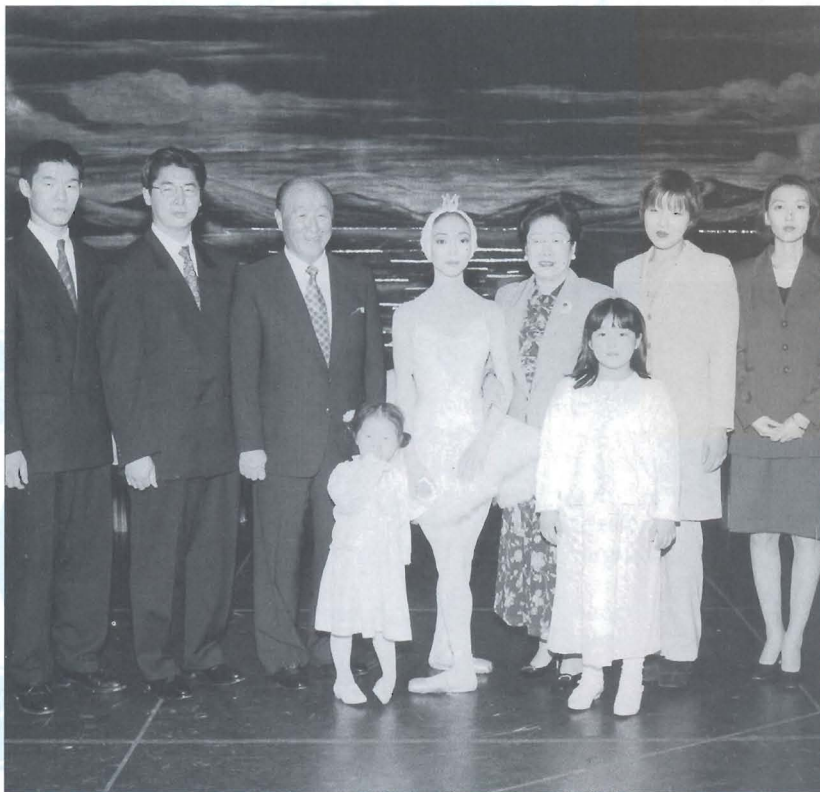
Front Cover: True Parents pose with members of the True Family after a performance of Swan Lake at City Center in New York.