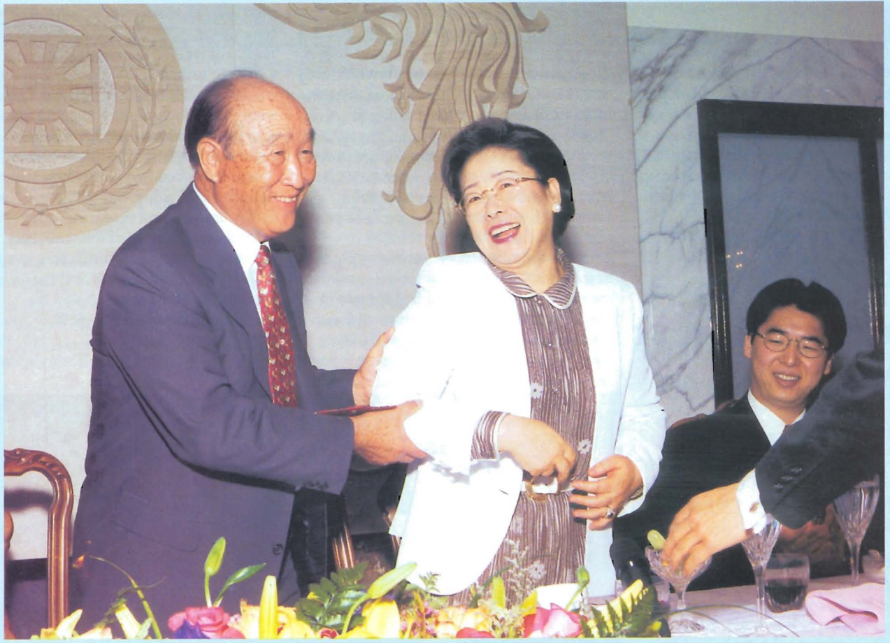
FATHER INVITES MOTHER TO SING AT A BANQUET HELD AT EAST GARDEN FOR THE UNIVERSAL BALLET TO CELEBRATE THE COMPANY'S FIRST U.S. TOUR.

“God has taught us to forget the good that we do for others. This creates a spontaneous and natural circular motion of give and take in our daily lives. It is similar to the natural phenomenon we observe in the atmosphere. This constant cycle of give and take leads to eternal life.”