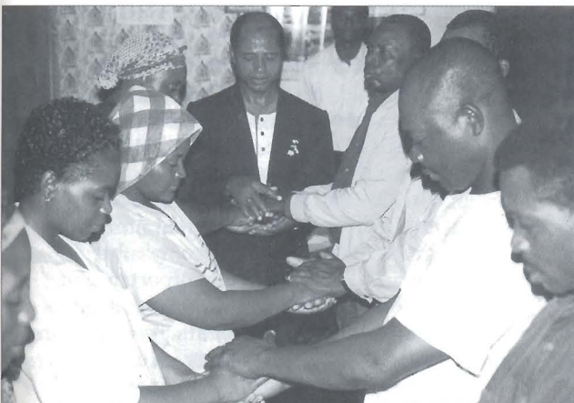
Blessing in July for a community in Cameroon.