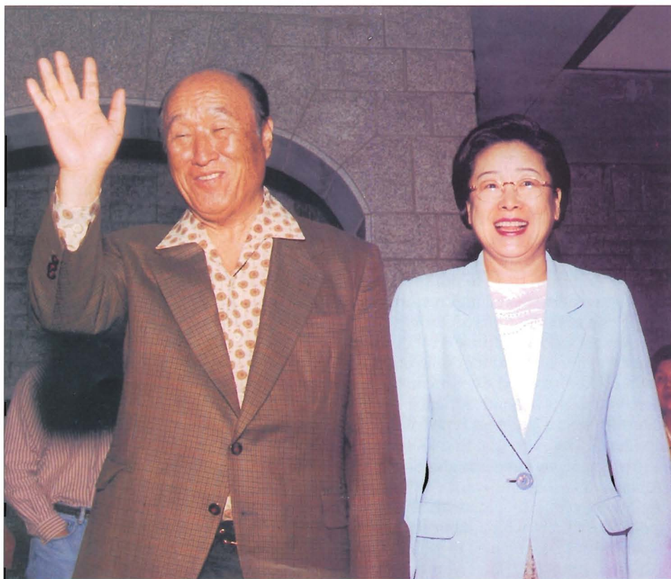
True Parents are happily re-united at East Garden after the completion of the North American Hoon Dok Hae tour.

[To be continued in the next Issue. Edited for Today's World]