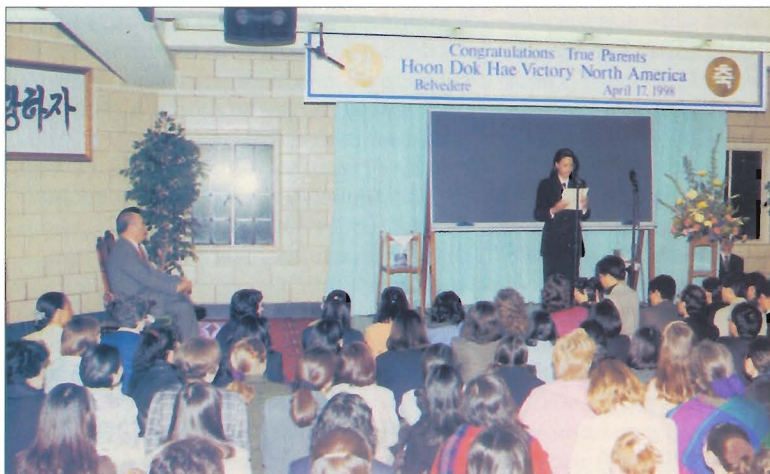
True Parents' Hoon Dok Hae Tour victory celebration at Belvedere on April 17.