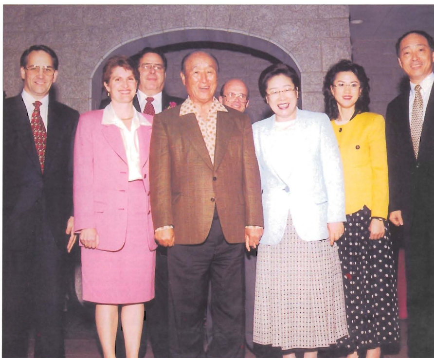
Welcome home, Mother! (East Garden, April 17, 1998)

When we pray, we very often pray habitually, "Precious Heavenly Father, our true God." But there has been no absolute trueness before today. Therefore, the origin, to which trueness is to be related, is not within the history of humankind but is located outside of history. Everything starts from there. The