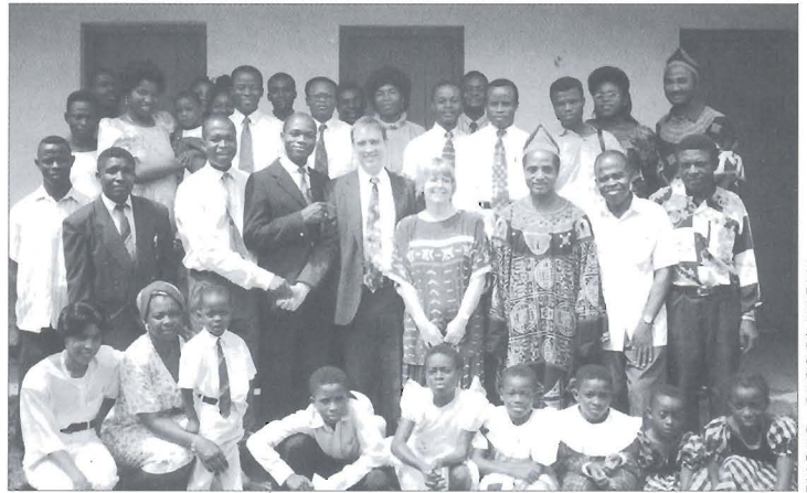
FFWPU staff members at their headquarters in Limbe, Cameroon in June 1997.

As Cameroonians are never happy with mere words, we wanted to show them something that has real substance, so we sat down and looked at all the organizations our True Parents have started and all the conferences as well as projects completed. It was a surprise even to us when we looked at what has been accomplished. We tied all these projects together under the umbrella of IRFF, which provided the substance we were looking for. Each organization by itself is perhaps not enough, but together the picture is wonderful and powerful. IRFF is the best organization to center the other projects around, as its mission does not force anyone to look at themselves. We explain how IRFF is working with WFWP, IRE, YFWP, FWP, WIDP, SCWP and FFWPU in order to build a stronger nation. IRFF can take credit for bringing the good