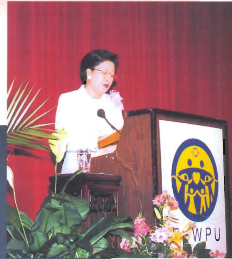
Bridgeport University, April 2.