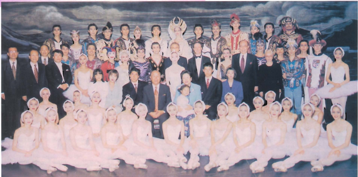
TRUE PARENTS, TRUE CHILDREN AND CHURCH LEADERS POSE WITH THE UNIVERSAL BALLET COMPANY FOLLOWING ITS FINAL PERFORMANCE OF SWAN LAKE.