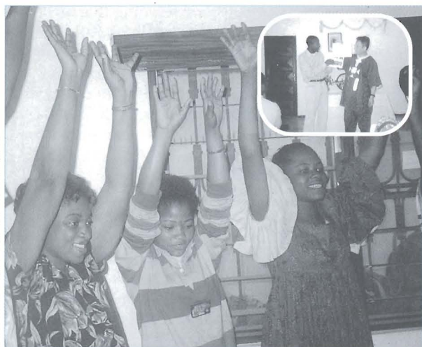
Togo's first public Hoon Dok Hae; March 1, 1998.

As Father himself explained in the CONTINUED ON PAGE 27