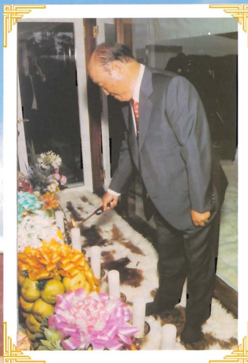
Father lights the offering table candles.