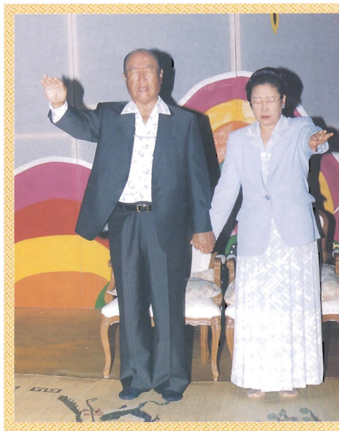
Father and Mother offer prayer. (January 4, 1998, Uruguay).

To reach the number ten, we have to begin from one. Ten times one is ten. Ten times ten is a hundred. Ten times a hundred is a thousand. If we start with this three-stage concept, human history could be as long as 30 million years since the creation of the world by God. We may say that according to the Bible there was a 2,000 year period, followed by another 2,000 and another 2,000, but it could be 2,000 times 10, or 20,000 years in each period, or we can say that 2,000 means 2 million or 20 million years. So basically human history has been longer than 20 million years. However, once we reach