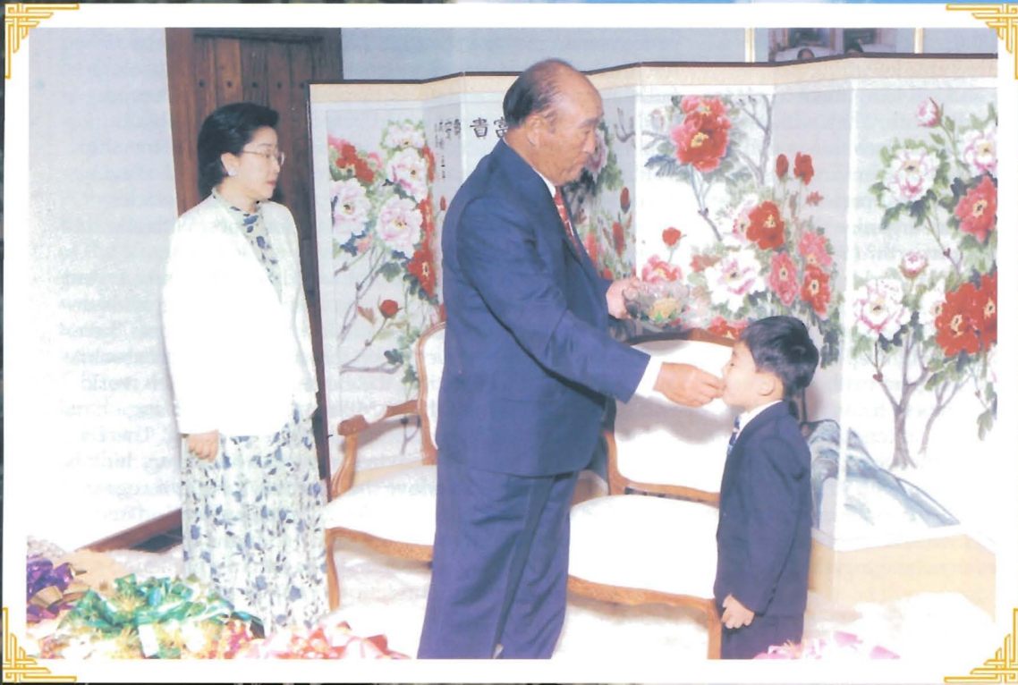
Father feeds Shin Joong Nim with food from the offering table.