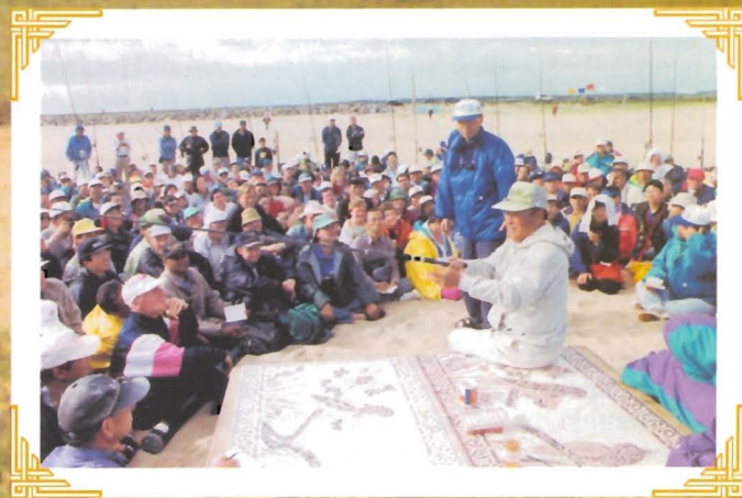
Father holds a fishing training session on the beach at Punta del Este. December 31, 1998.