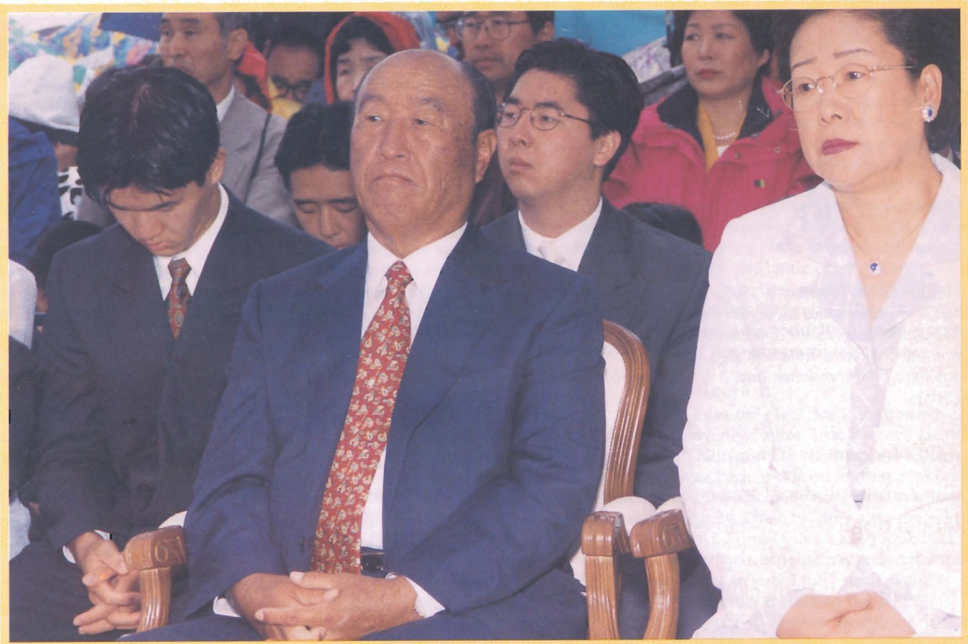
The Day of Victory of Love, January 2, 1998, Punta del Este, Uruguay.

Individuals should be willing to sacrifice themselves for the sake of the family, the family for the sake of the tribe, the tribe for the sake of the nation, and the nation for the sake of the world. In other words, individuals should become the material with which to build the family. The family should become the material or resource to build the tribe, the tribe to build the nation, and the nation to build the world. We can be proud of ourselves in this way, as the center of the family, tribe, society, nation and world, because we are the very material to build all those different levels.