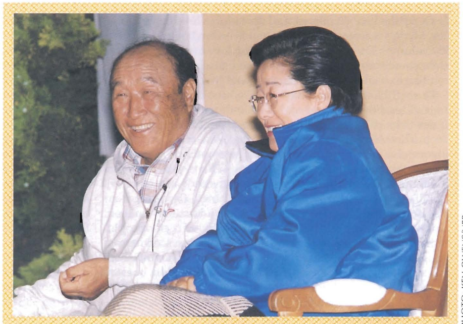
True Parents enjoy the entertainment program on the Day of Victory of Love, in Uruguay.

God has been keeping absolute silence and tranquillity for thousands of years, yet no one noticed. God has been silent for thousands of years, but now finally the time has come when God wants to share something precious. Do you think that God would want to give it to someone much lower than He is or to