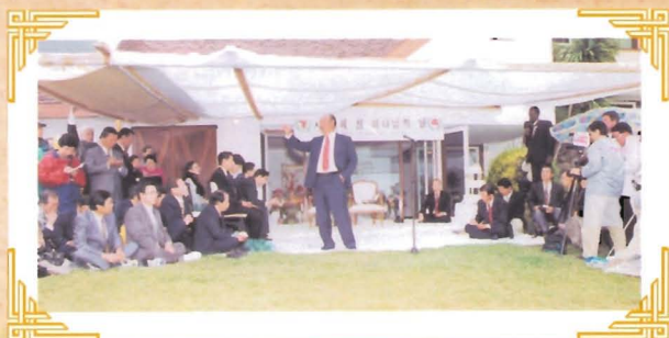
Father delivers the True God's Day morning sermon. (Background) True Parents' home at Punta del Este.