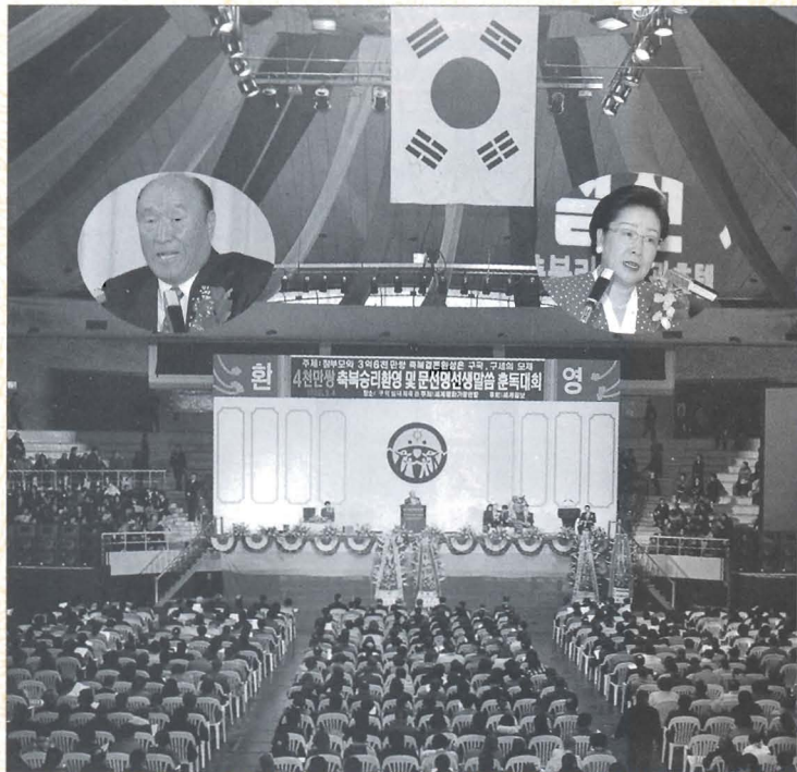
Front Cover: Pictures from True Parents' speaking tour in Korea. (l.) Father during the Hoon Dok Hae in Seoul. (main photo) The Hoon Dok Hae in Pusan. (r.) Mother speaks in Korea in 1997.

True Family at Punta del Este for True God's Day 1998 14