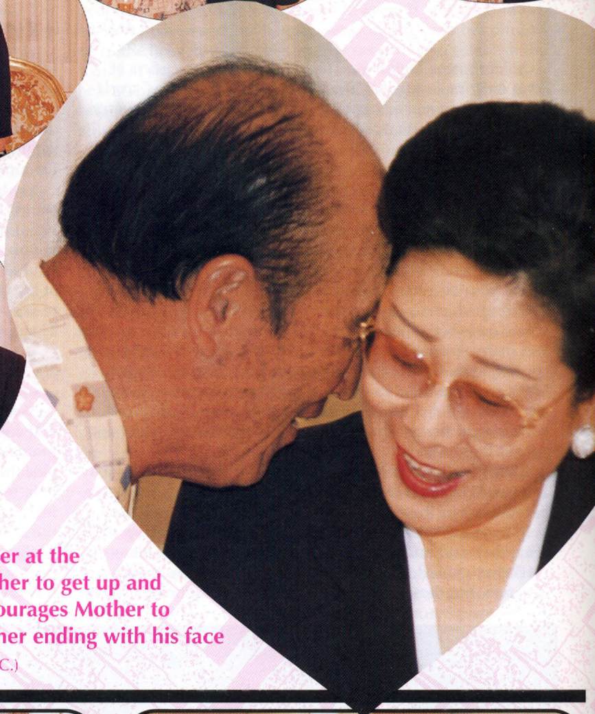
(From top r. to center) Mother sings to Father at the victory celebration. Mother encourages Father to get up and sing. Mother pulls Father's arm. Father encourages Mother to sing together with him. Father sings to Mother ending with his face on her cheek.