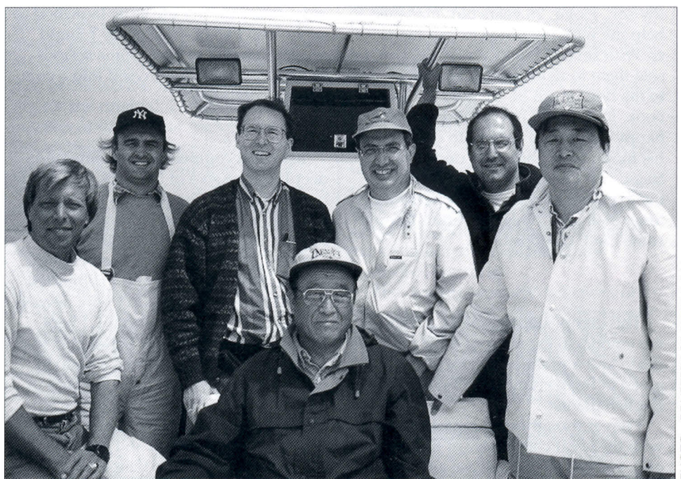
Father poses for a picture while fishing with the lawyers.