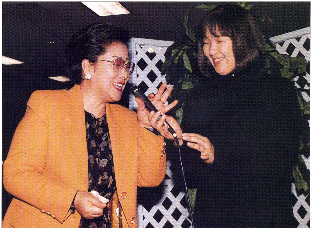
Mother and Sun Jin Nim share the victory of the speech in Philadelphia.

What is next? We should restore God's family and God's country. The responsibility of blessed families is to visit village by village in the satanic world day and night, shedding blood, sweat and tears until not one person remains in the satanic