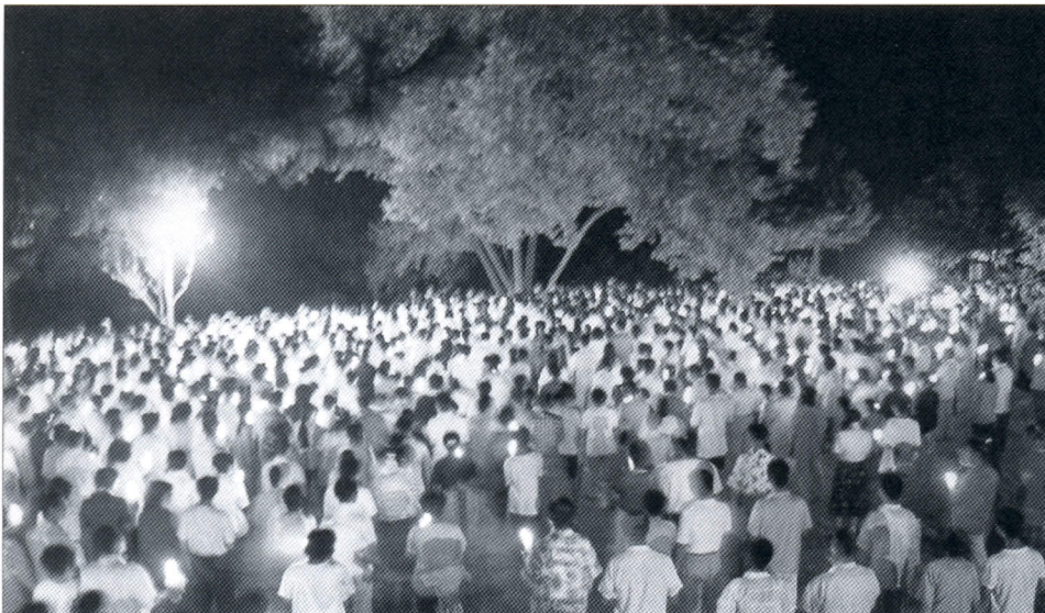
National Messiah candidates praying before the Tree of Heart.