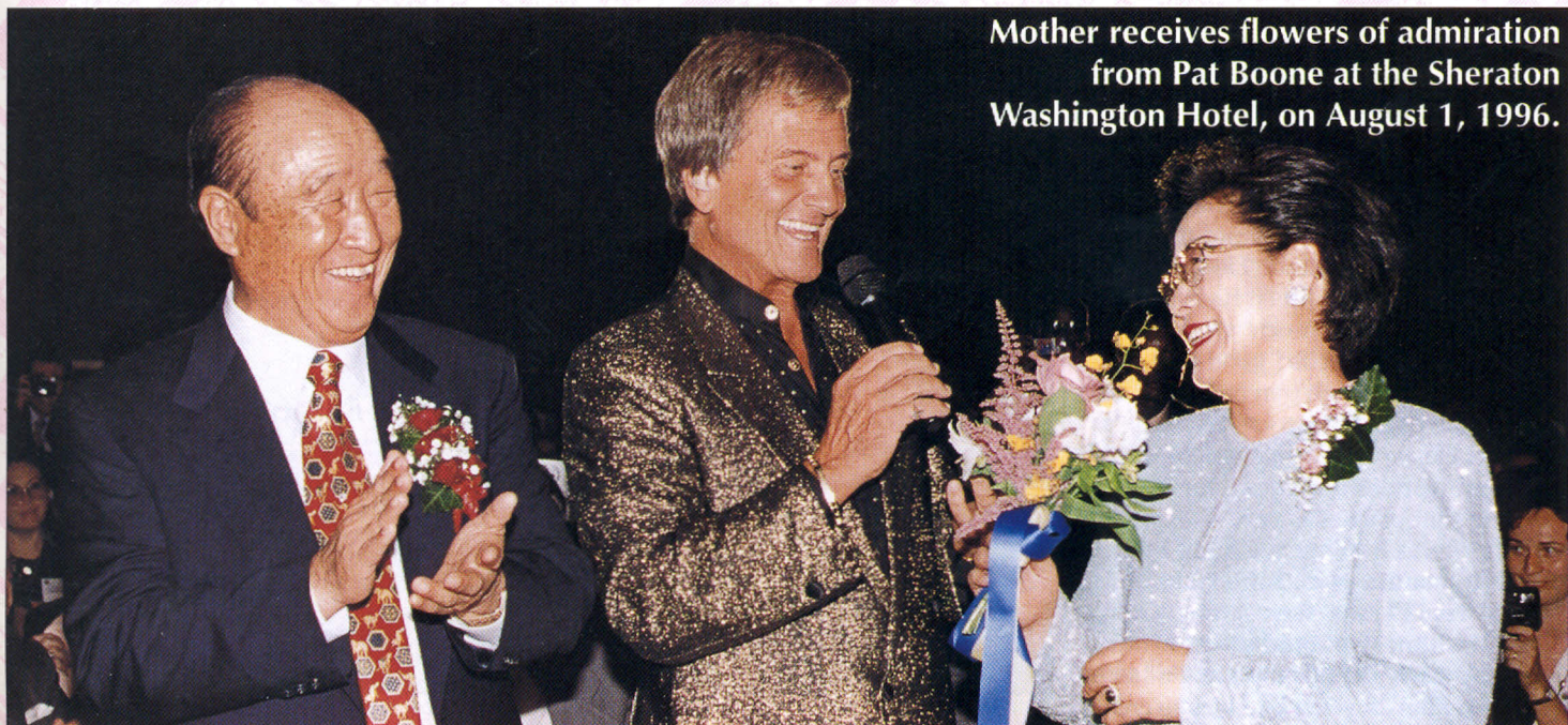
Mother receives flowers of admiration from Pat Boone at the Sheraton Washington Hotel, on August 1, 1996.