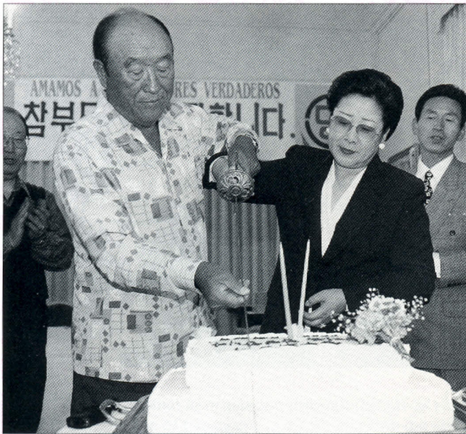
Front Cover: Father and Mother cut the victory cake during the celebration in Montevideo, Uruguay, September 26, 1996.