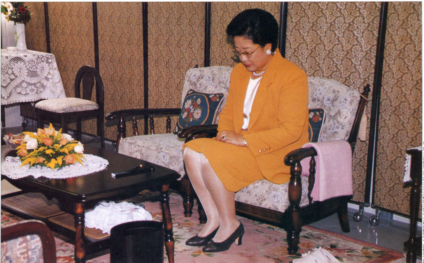
Mother praying upon arrival at the event site in Kobe, Japan.