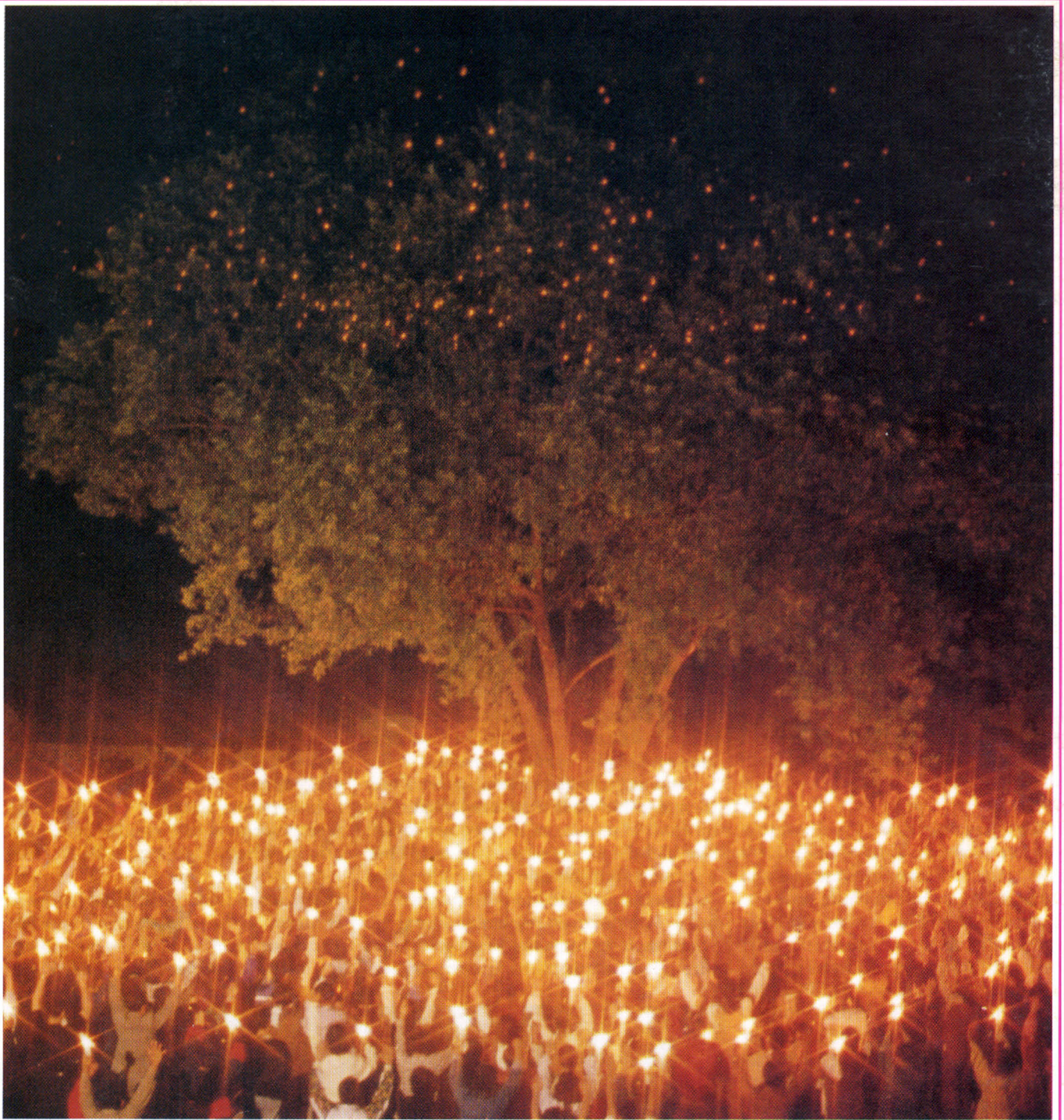
Angels manifesting in the Tree of Love as hundreds of lights, during a midnight prayer service at Chung Pyung Lake.

YOU SHOULD FOLLOW THE ORDERS OF YOUR CONSCIENCE. YOU SHOULD APOLOGIZE TO HEAVEN AND PLEAD WITH HEAVEN. THE CONSCIENCE GOES AHEAD OF PARENTS, TEACHERS AND MASTERS. GOD IS THE PARENT, TEACHER OF TEACHERS AND MASTER, AND THE CONSCIENCE IS CONNECTED DIRECTLY TO GOD. WHEN YOU GO AGAINST IT, IT INSTRUCTS YOU RIGHT AWAY. ALTHOUGH YOUR PARENTS MAY NOT BE ABLE TO GIVE YOU AN ORDER, YOUR CONSCIENCE CAN.