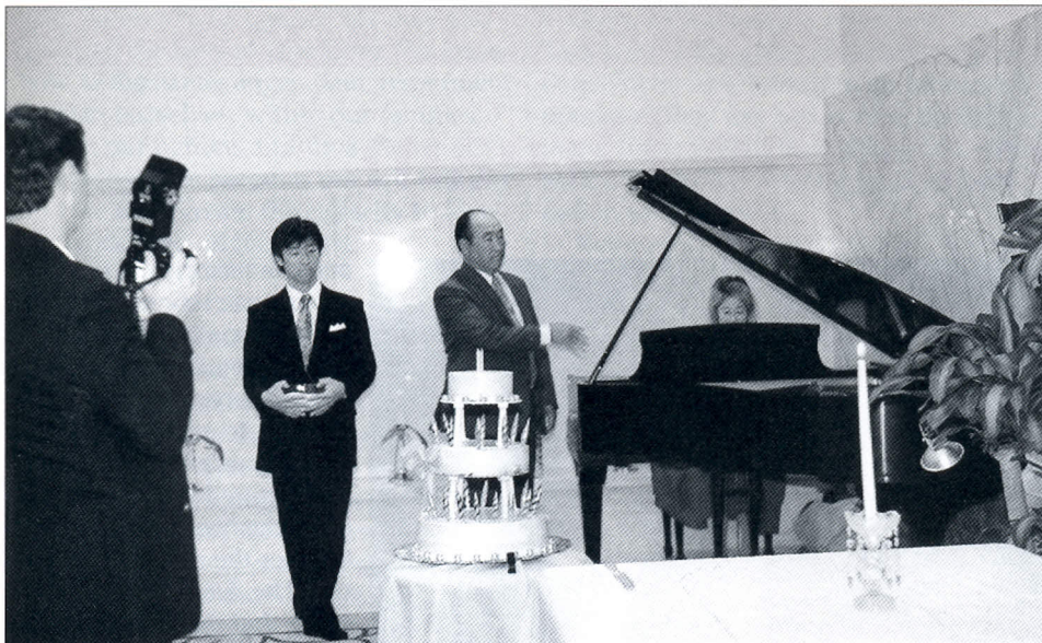
The grand opening of the new East Garden building on July 26, 1987. Father is holy salting one of the two newly purchased Steinway Grand pianos.

Heung Boo and Nol Boo , a story about Cain and Abel type brothers. My background in the "Equal Interval System" helped me to write music depicting monsters, terror, joy or whatever other expression was needed for the script.