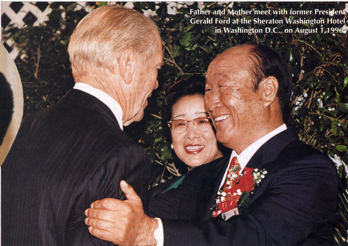
Father and Mother meet with former President Gerald Ford at the Sheraton Washington Hotel in Washington D.C., on August 1, 1996.