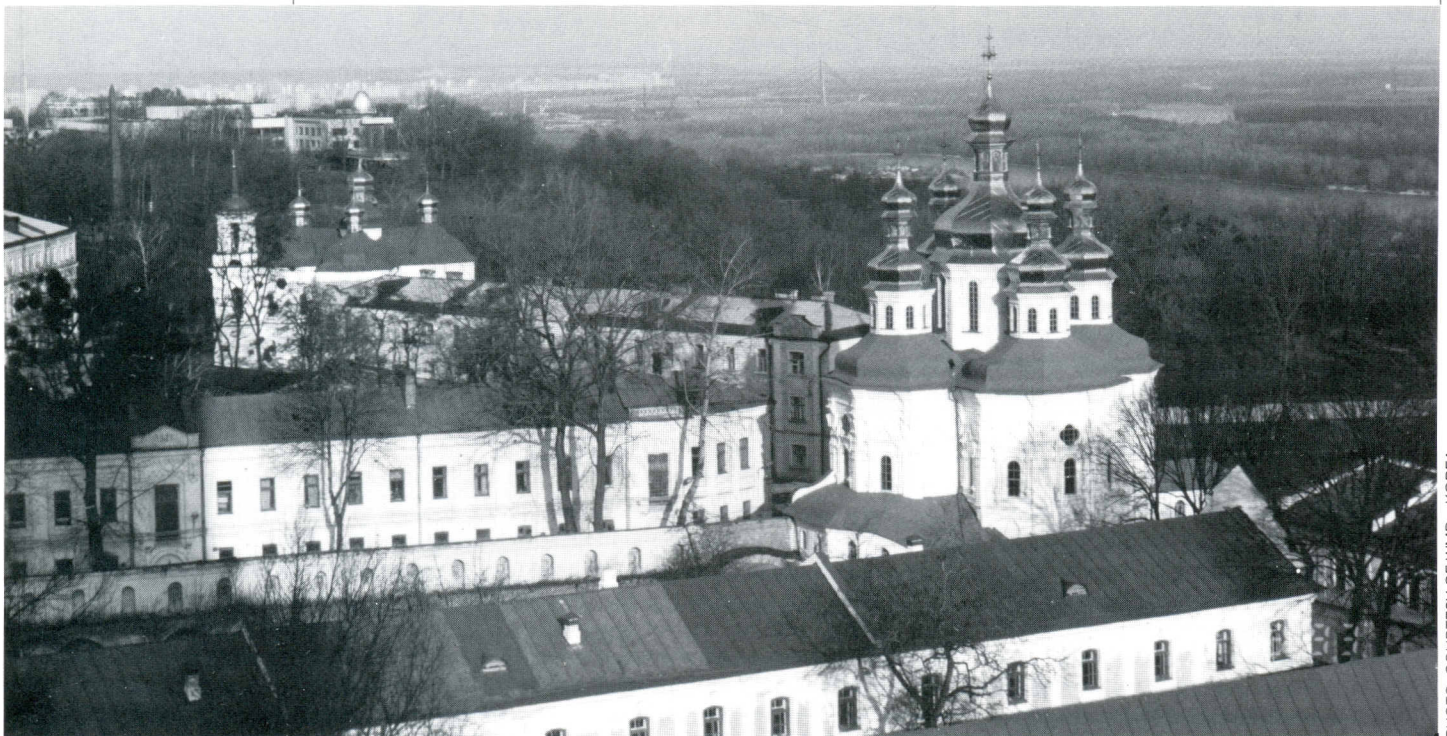
The location of the first Ukrainian Orthodox Church is pictured above. Ukrainians are proud of their leading role in the founding of Russian Orthodoxy, which began in Kiev in 988 A.D.