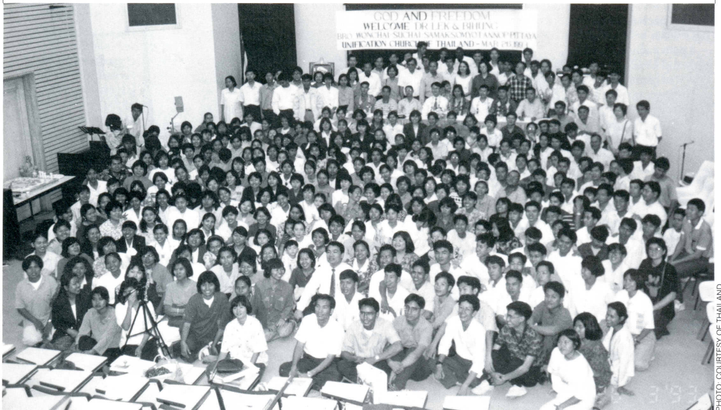
The entire Thai family gathers to welcome the seven brothers and one sisters home after twenty-one months in prison.

We were often reminded of Jesus' words in the Bible, "From the days of John the Baptist until now, the kingdom of heaven has suffered violence, and men of violence take it by force." Satan tried to