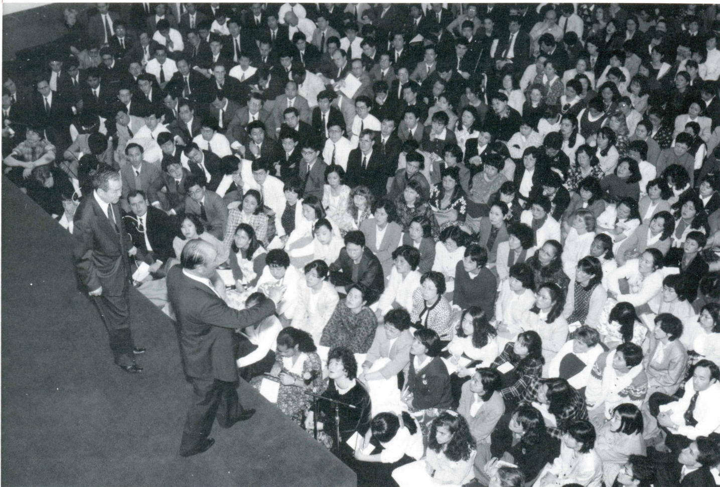
Father teaches, "How to unify yourself is your biggest problem. Your enemy is your body. The enemy kingdom is encamped in your body. Satan's attitude dominates in the body. Free sex is Satan's idea for breaking the power of God's foundation."

Satan's control is everywhere: on the family level, tribal level, national level, and world level. You have to overcome him in order to enter heaven. At the last terminal, Satan will confront