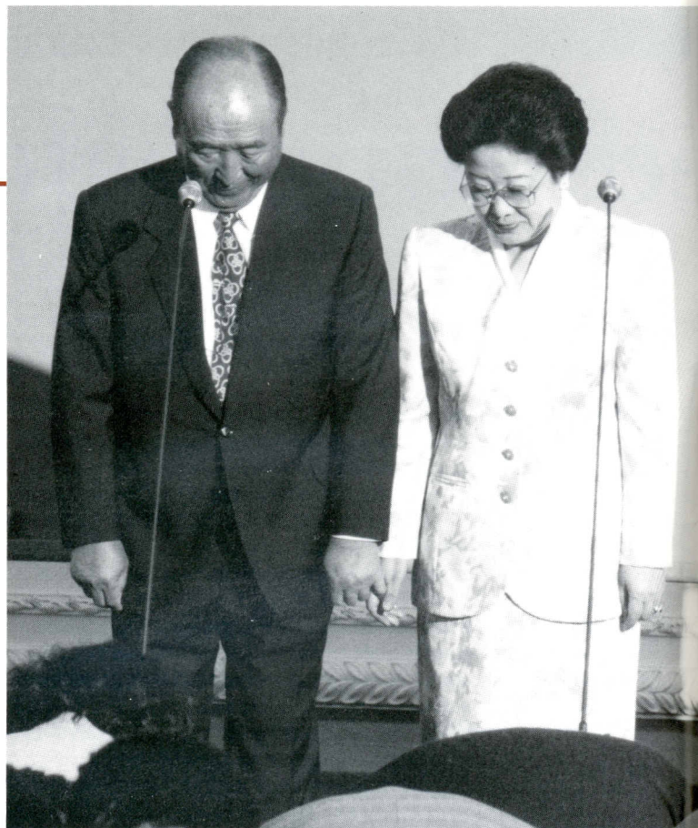
Father and Mother praying. Father then preached, "Your going through indemnity helps God re-create you and makes Satan separate from you."

Satan exercises all his might to make us serve him. You can refuse, claiming that you are from God. However, in order for God to lift you up, you must go through the indemnity course. If you protest against the way of indemnity and stage a revolt, you cannot be material for re-creation, and God cannot work