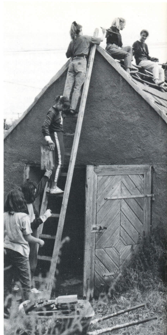
RYS participants fix a shed on the school playground in Tatabanya.