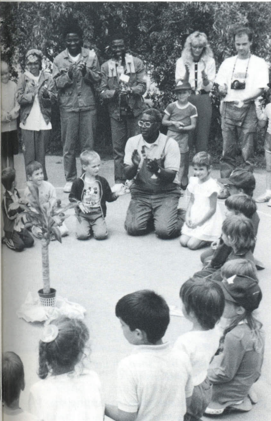
Children as RYS participants join in.

On our first actual work day, after a delicious breakfast by our special vegetarian restaurateur, who never failed in the entire two weeks to try to please all of our tastes, we were greeted at 7