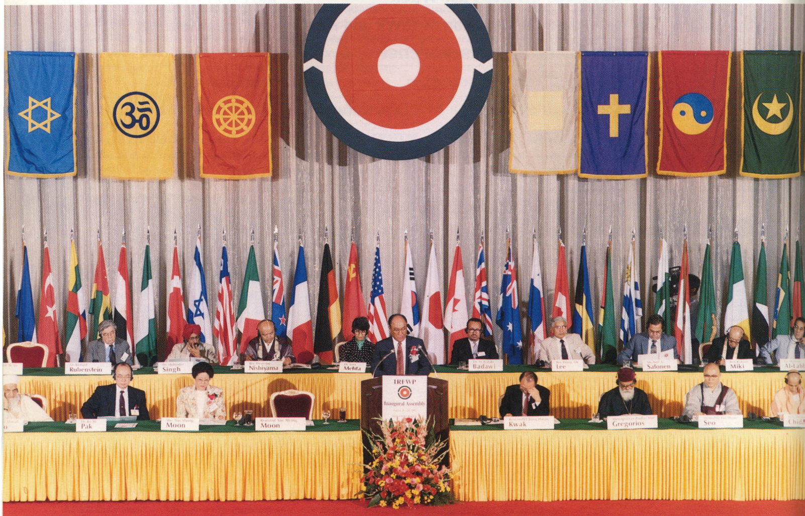
Father delivers the Founder's Address at the Inaugural Assembly for the Inter-Religious Federation for World Peace on August 27, 1991.

At the second Assembly of the World's Religions, which was held in San Francisco one year ago, I called for the creation of the Inter-Religious Federation for World Peace. Today, with the cooperation of religious leaders such as yourselves and in the presence of representatives of religions from around