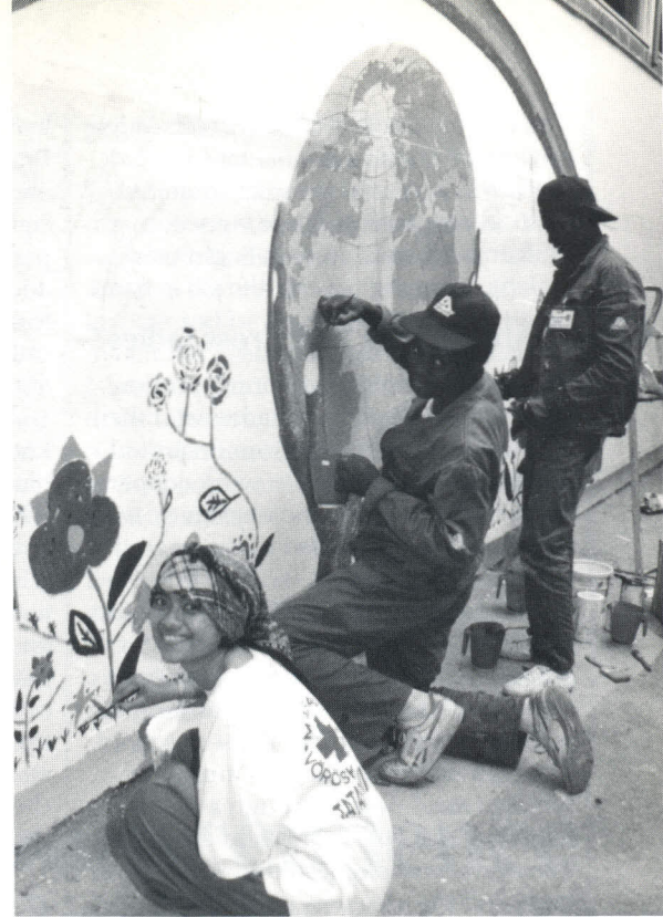
RYS'ers add a mural to newly painted walls at a Tatabanya school.

Our team members came from Sri Lanka, Israel, Syria, Nigeria, Ghana, Scotland, Austria, Hungary, India, Switzerland, Britain, America, USSR, Bulgaria, Spain, Poland, Singapore, Bangladesh, Yugoslavia and Japan. These