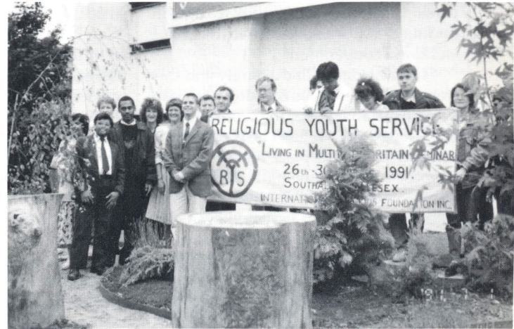
RYS volunteers pose together in front of the Japanese Peace Garden in Southall England, which they built from a piece of derelict land.

By June 26 all the plans had been laid. An architect had designed the garden for us and this had been approved by the planning committee; an area of wasteland belonging to the council had been chosen for the purpose and accommodations were arranged in the Dominion