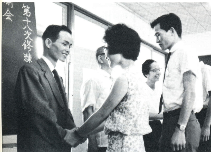
Participants sincerely thank their lecturers at the graduation ceremony of the 18th workshop at Toda Training Center, July 1964.

The next morning, I was really surprised to see the headlines in the newspaper. A big earthquake occurred in Niigata City, which I had left the day before; bridges were broken and houses had fallen down. I was shocked, but I felt peace within myself. I felt that what Heavenly Father had done through me would never be destroyed. ■■