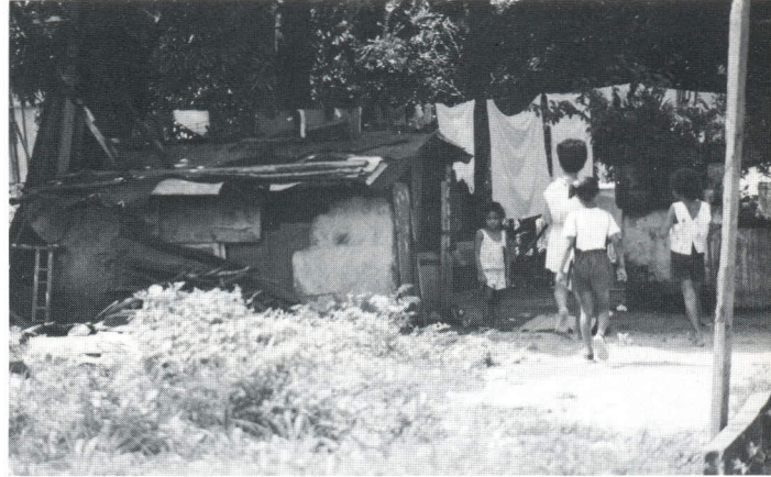
This shack typifies the situation of poverty in the favelas.

My conclusion was that the church needs people of talent and vision if we are to make a difference. I as one man would have difficulty effecting change without a large following. Father said