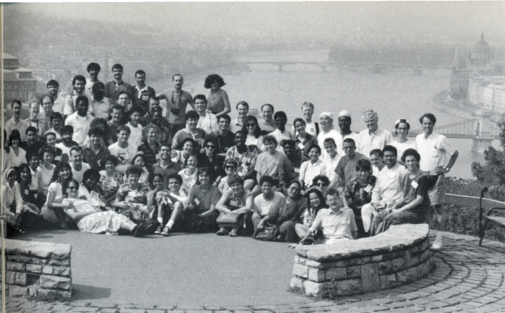
The entire group of RYS volunteers visits an overlook of the Danube River and Budapest city.

had no precedent in the history of Hungary and he was glad to witness the first.