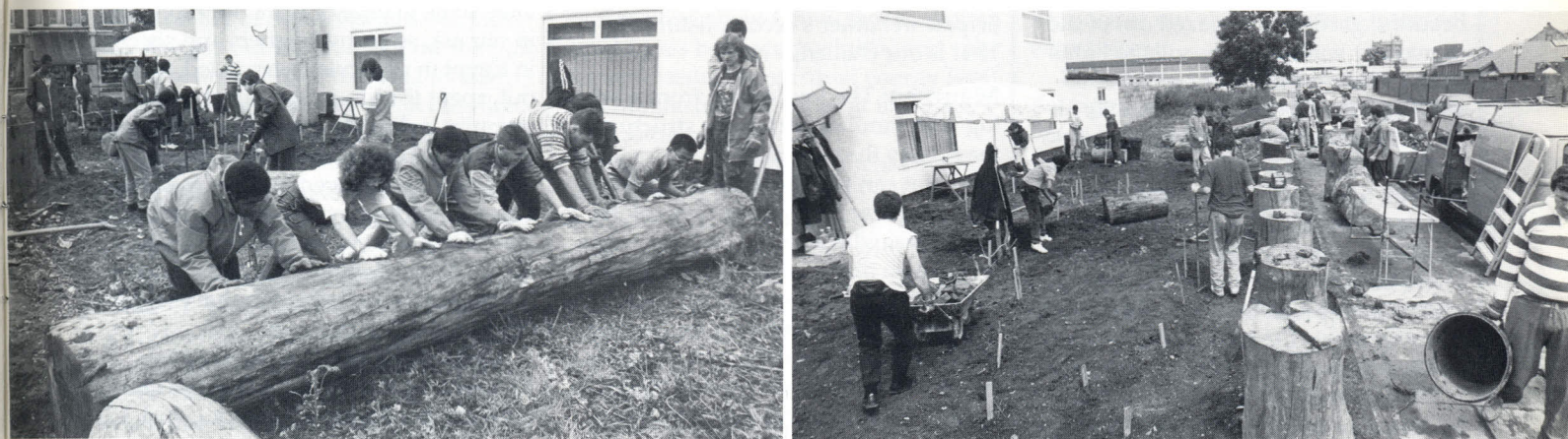
The harmonious team spirit of the RYS participants generates tremendous power. The largeness of the task at hand keeps all hands busy.

After looking carefully at a number of possible projects in this country, it was decided to adopt the Southall suggestion of a peace garden because of its