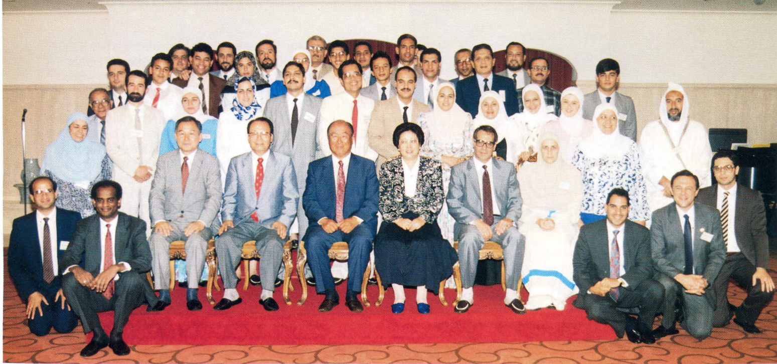
Egyptian Muslims gather for a joyful photo after hearing Father's speech during an East Garden banquet.