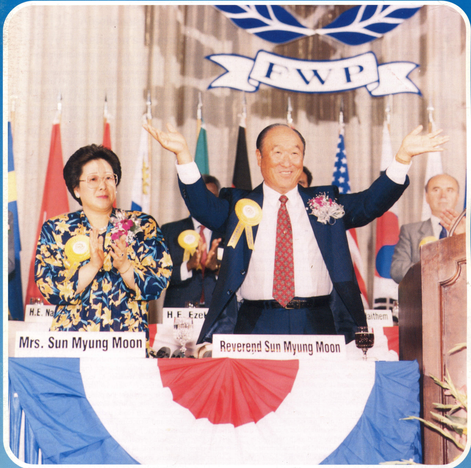
Inauguration of the IRFWP and the FWP