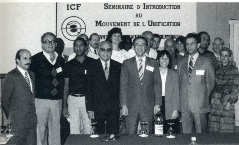
At an ISUM conference for North Africans in 1985, Turkish, Iranian, and European participants join Egyptian, Moroccan and Tunisian professors.

think he could sense something about True Parents behind me. I began to realize that there were probably many spiritual people in Egypt, though I only met a few in the early days.