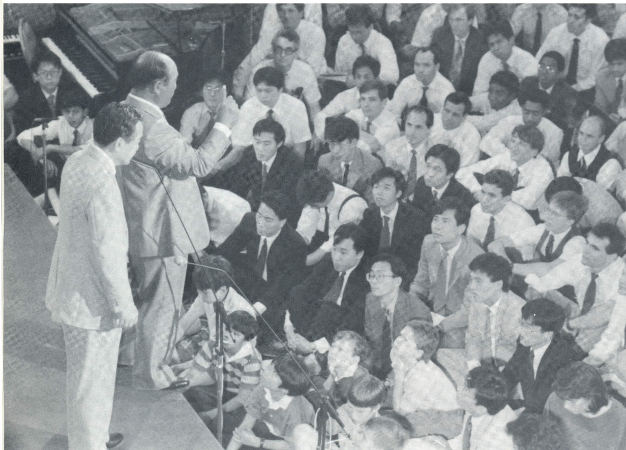
The second generation intently receives Father's words.

Having so many different languages is a result of the fall—a way Satan has divided and confused us. Only religious power centering on God's love can end the confusion and unite everyone.