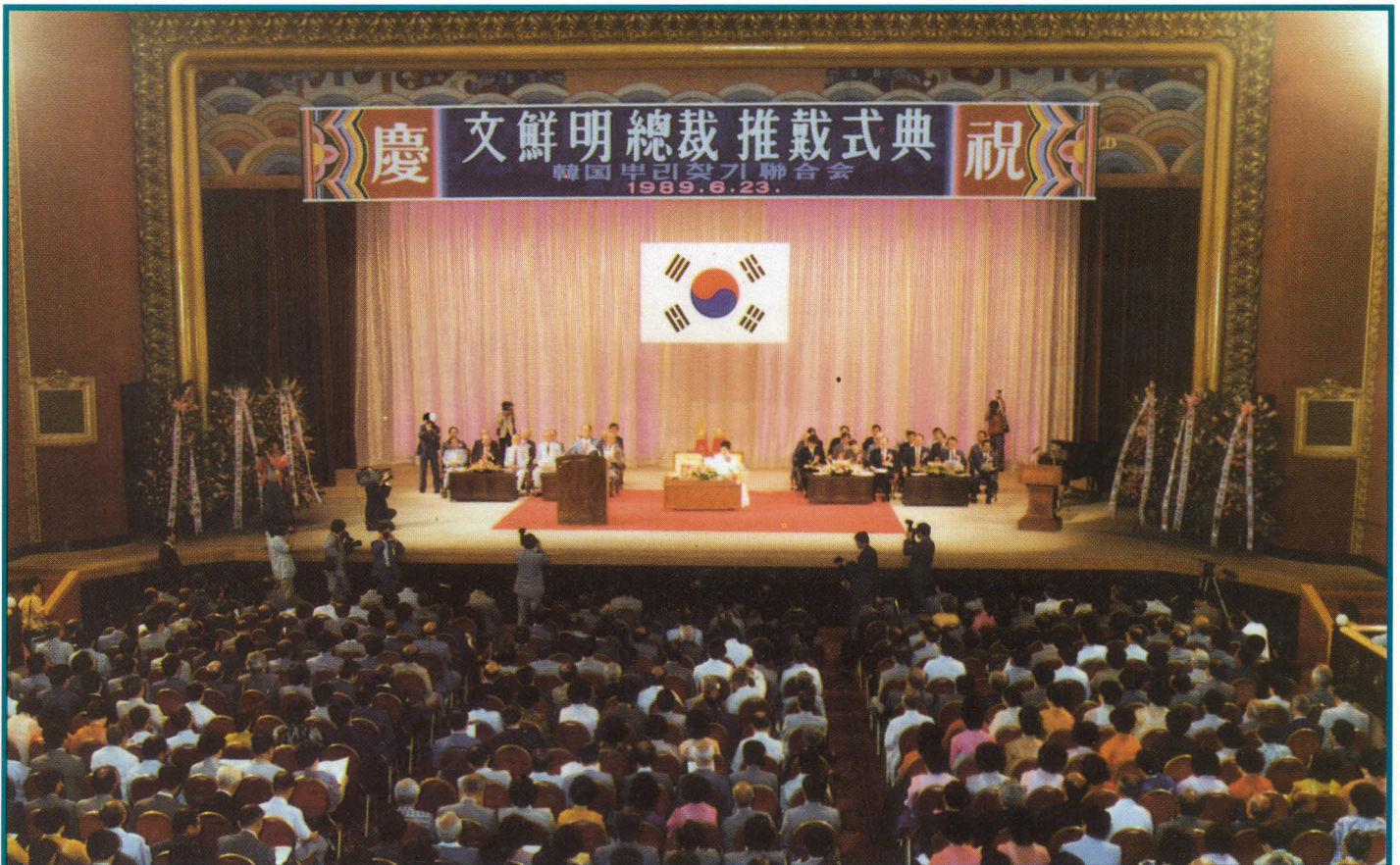
Father delivers his Chairman's address to the general audience at the Little Angels Performing Arts Center's main concert hall.