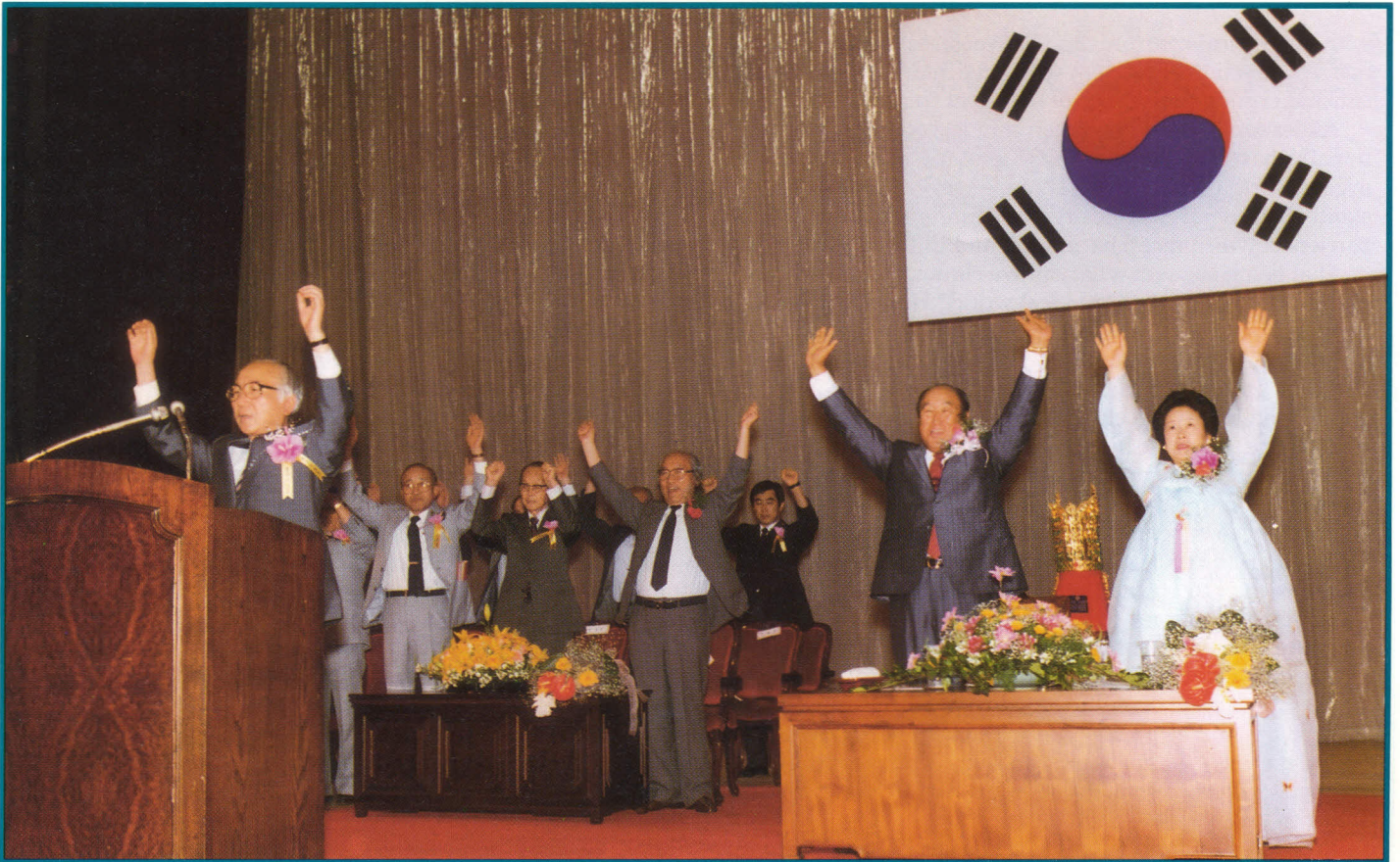
True Parents join in a ceremony-closing mansei cheer.