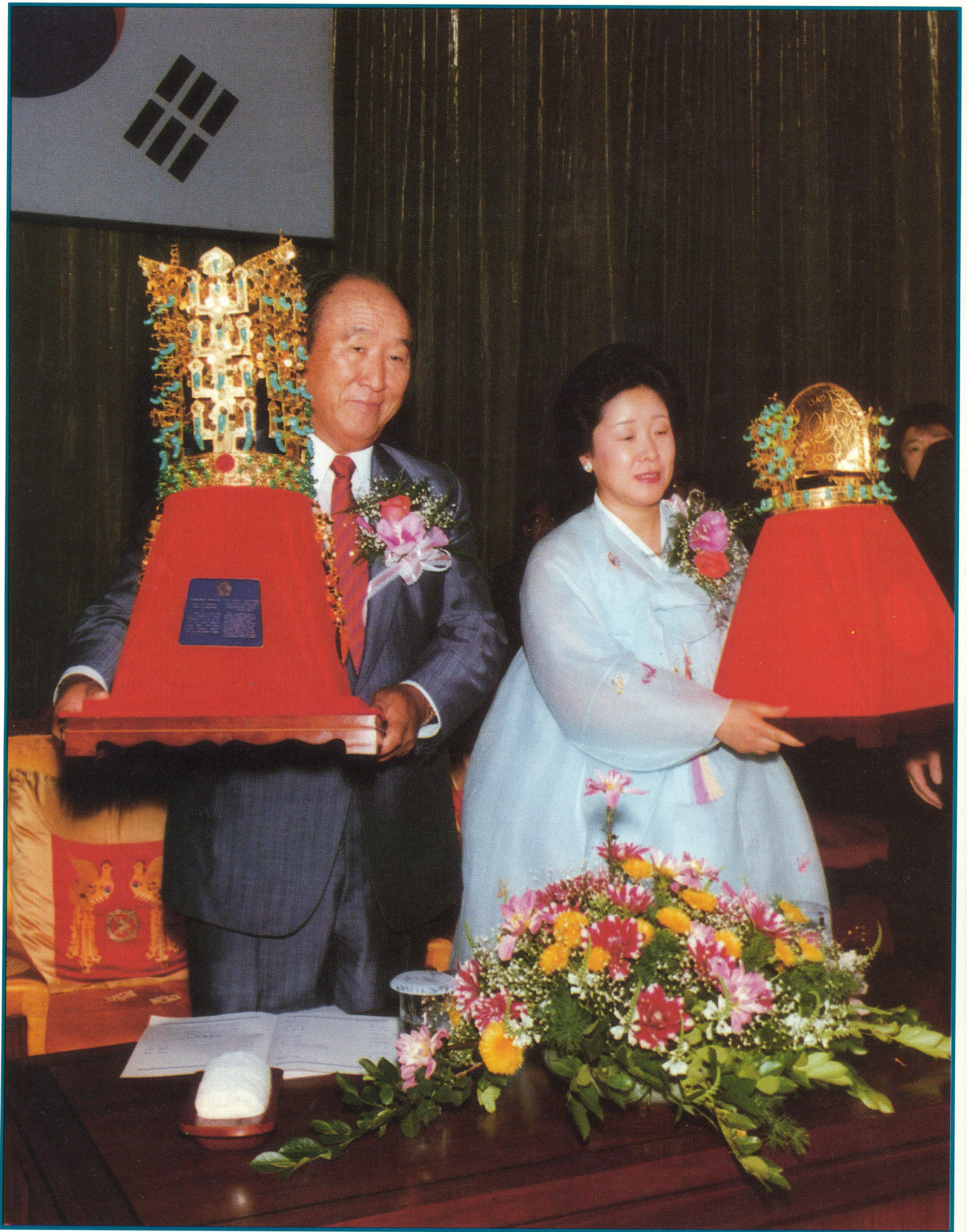
Father and Mother receive honorary crowns during the installation ceremony.