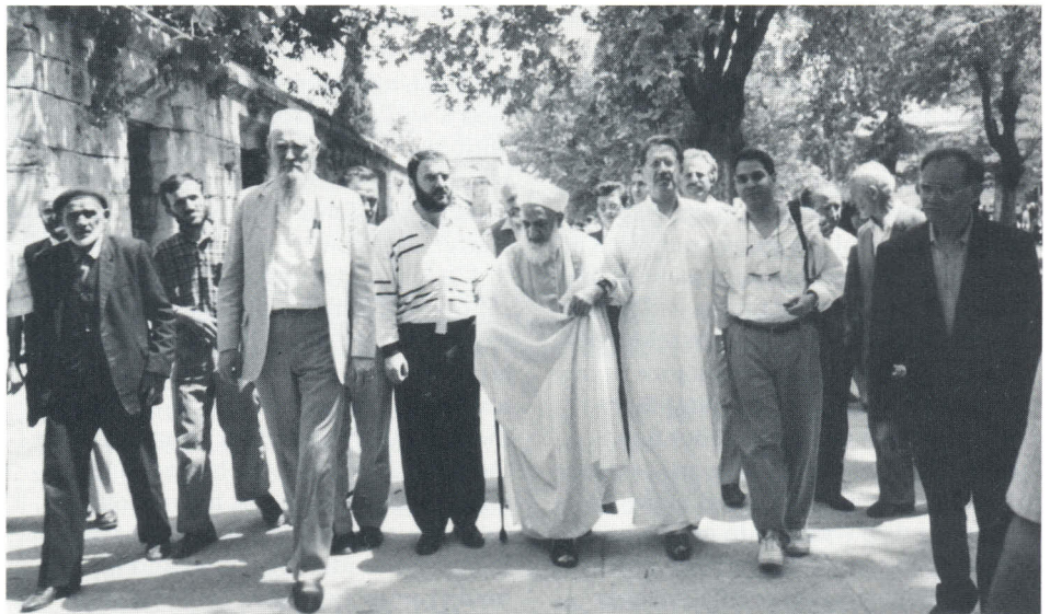
Returning from Friday prayers at the Blue Mosque in Istanbul.