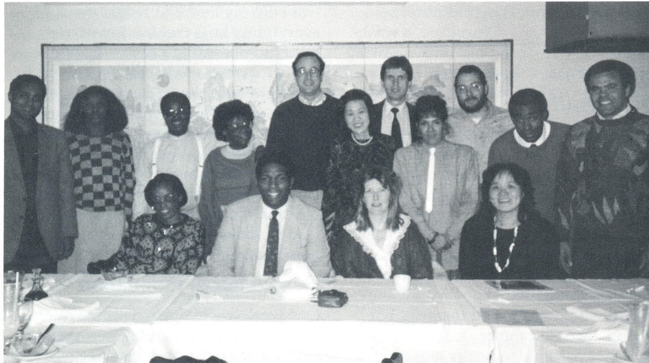
Home church events are occasions of joy.

Because the environment was bad, I felt I had to protect my children. We are the only Unificationists in our neighborhood. Everyone else is of a different belief. Until they were three years old, I really kept them close to me and tried to teach them the basic traditions. I didn't send them to preschool. But when my oldest daughter turned four, I could see that she was very shy. She wouldn't go anywhere. Then at one point she asked to go to school, but I couldn't find a school I was confident in that was close enough and religious enough. All of a sudden, an ICC contact came up to me