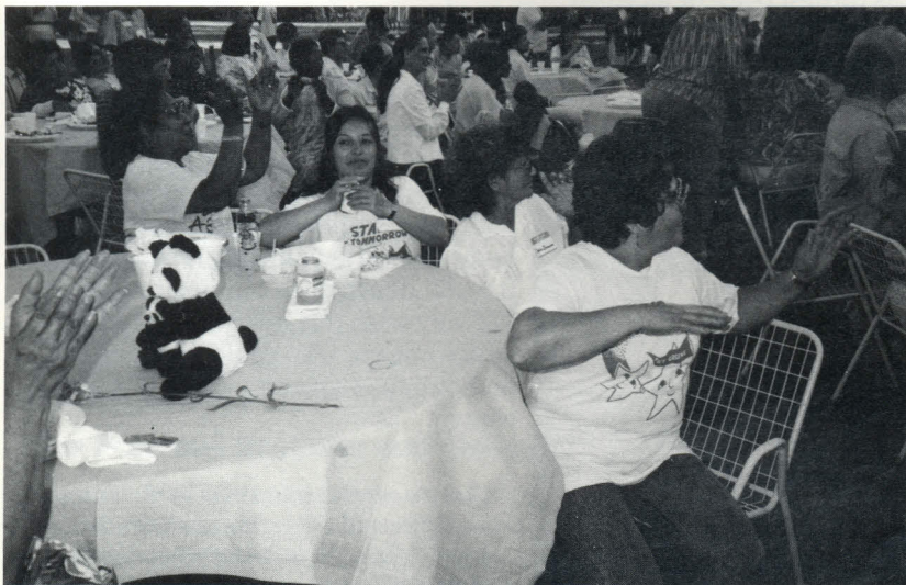
Home church guests appreciate the entertainment at the UTS Open House.

A: Our deepest experience in doing home church has not been one single