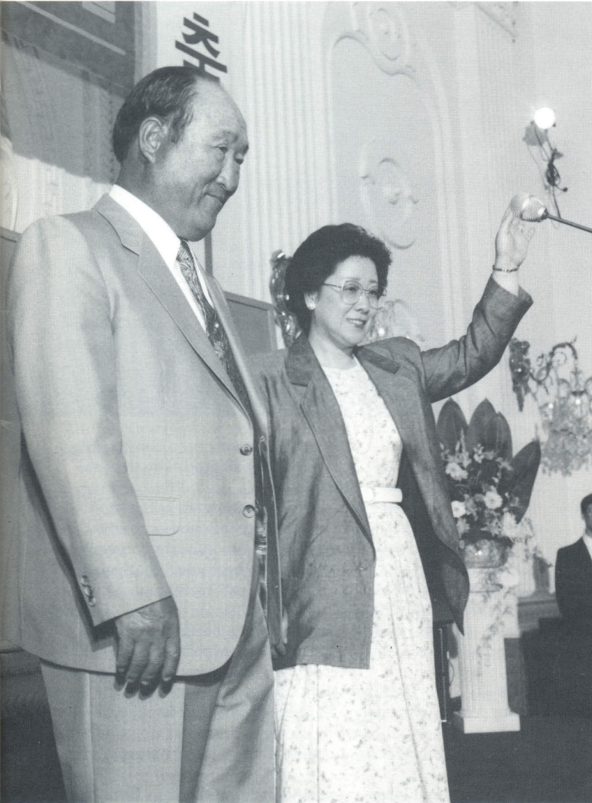
A joyous greeting from our True Parents.

Now all things are hailing me, thankful that I understood their situation and included the Day of All Things as equal in importance to God's Day, Parents' Day, and Children's Day.