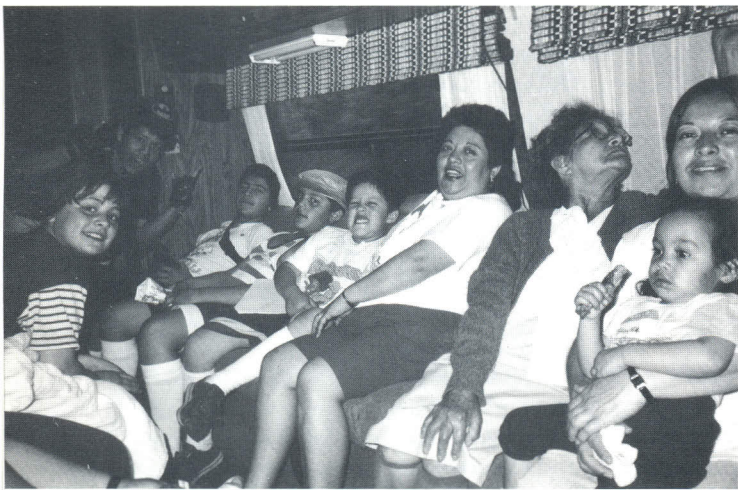
Families enjoy a ride to the country.

A: We have always tried to invite people to attend Unification Church sponsored events. We are grateful to the Unification Theological Seminary for its beautiful open house held in May of each year. This day is so special to the families we bring up each year that when we drop them back home at the end of the day, completely exhausted,