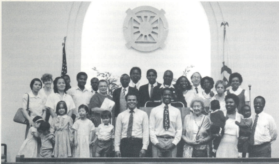
The Harlem Church congregation.

I do feel that God really looked after us and took care of us in so many ways. Almost all our furniture came from someone giving it to us or God giving it