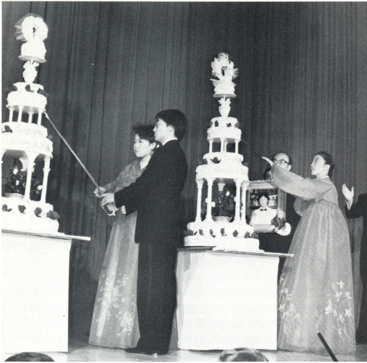
The newlyweds cutting their traditional wedding cakes.