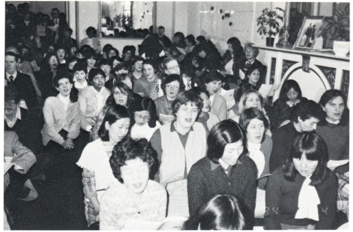
Brothers and sisters at the Lancaster Gate ballroom

We had the attitude with each person we met that we could say to them, 'Come! Go with us! No matter what has happened in the past, come with us now. We have great things to do.'