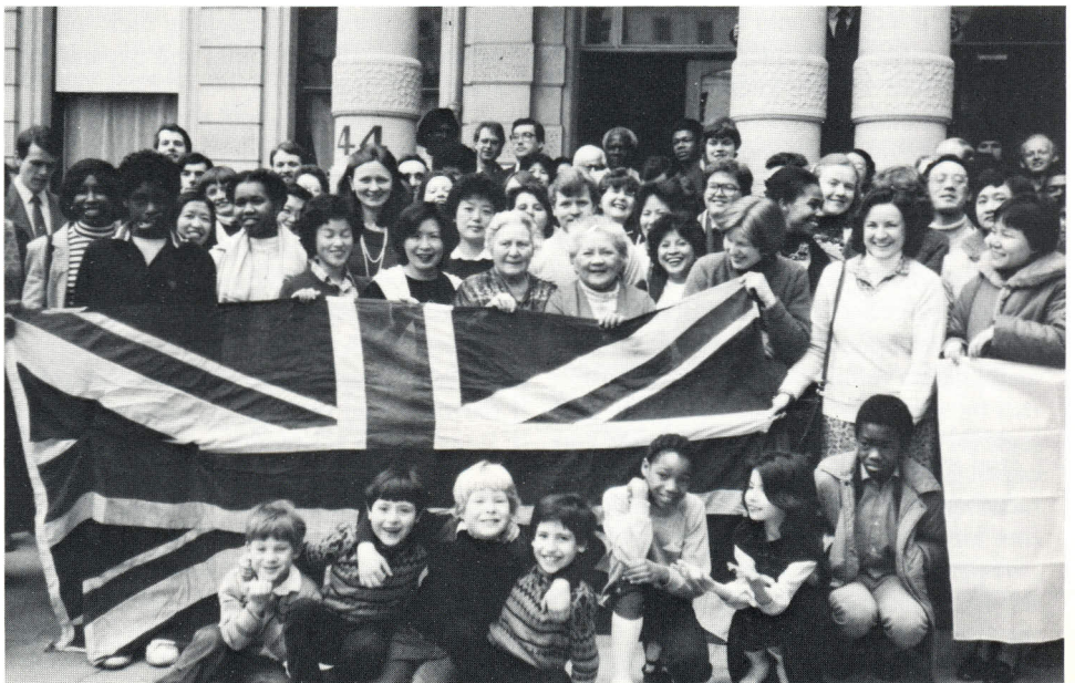
Members of the British Family in front of Lancaster Gate.