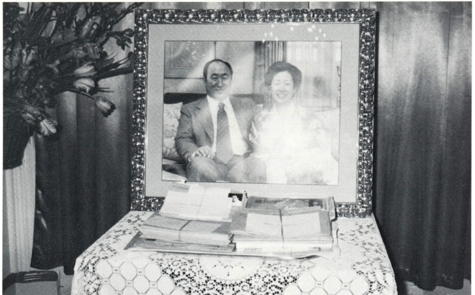
All 733 membership cards were offered to True Parents.