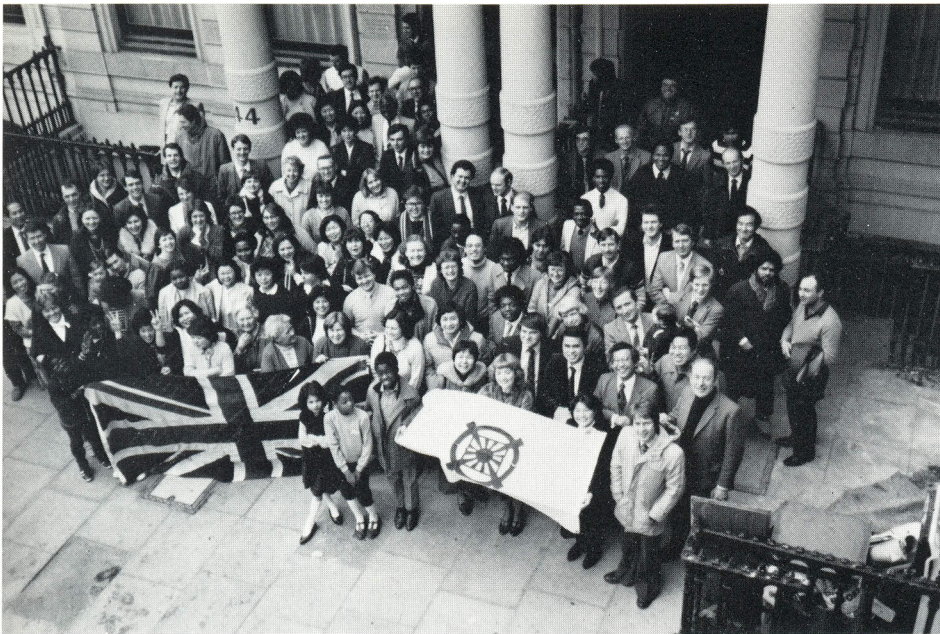
Brothers and sisters in front of Lancaster Gate from a "God-eyed point of view."

I believed that people in communist countries around the world would have some internal experience because of my external witness here.