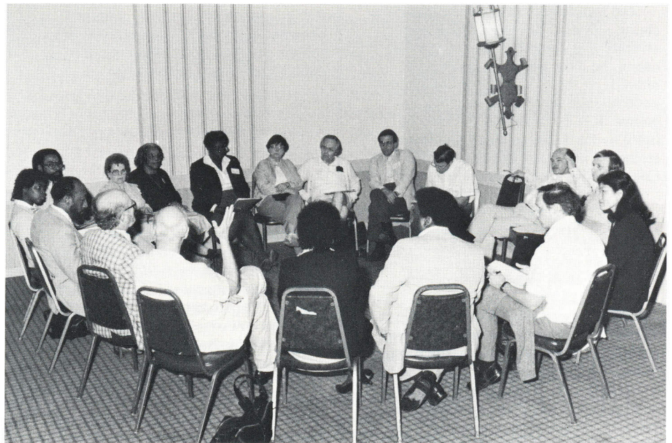
Discussion groups: unity in diversity.

The format of the conferences was very similar to those of the previous three: Divine Principle lectures in the morning, leisure time in the afternoon, and talks on the Unification movement and its social and ecumenical outreach in the evening. (Please see the August 1983 issue of Today's World for more information on the Interdenominational Conferences for Clergy or ICC, the National Council for the Church and Social Action or NCCSA, and the conference format.) Mealtimes were often spent in active conversations, in which views on theology, lifestyle and the Bahamian weather were discussed as people tried to understand the various ways in which we serve and understand God. For many, it was the first interfaith and interracial conference they had ever attended.