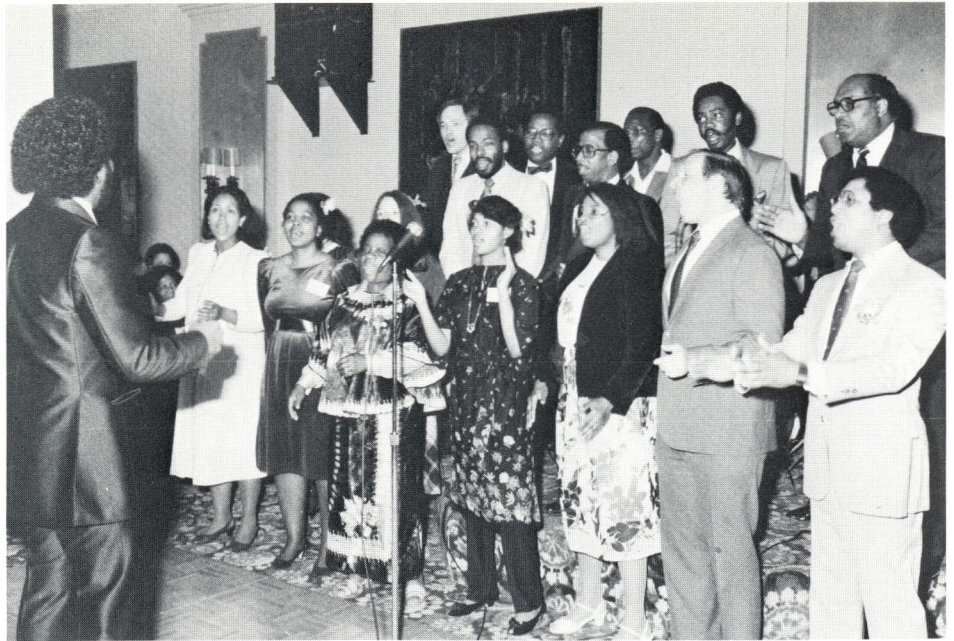
Sweet inspirations from the choir.