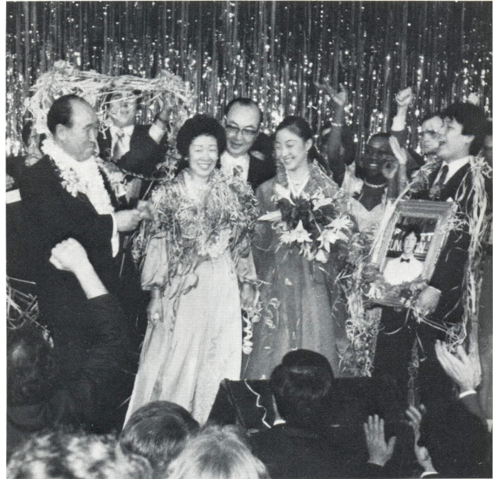
Happy singing and dancing conclude the historical and monumental day.